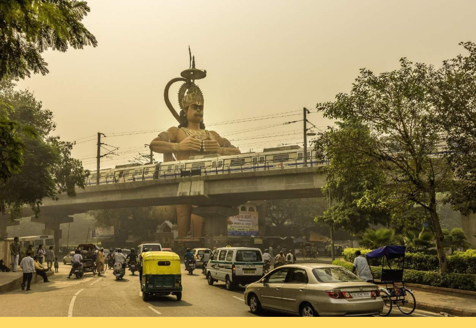
Day 3 - Amritsar / Delhi