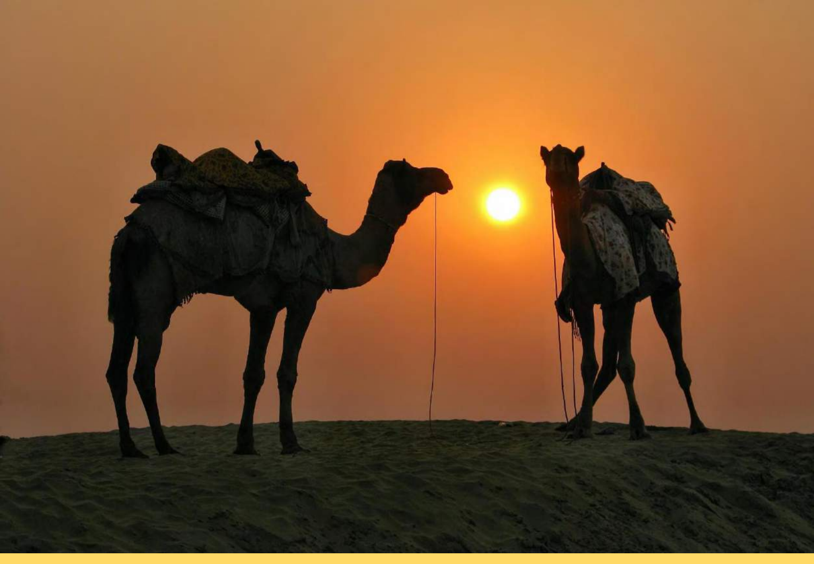
Day 3 - In Jaisalmer