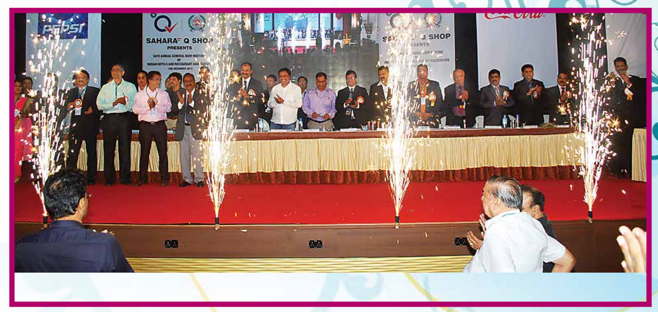
The fire work at the conclusion of AGM event.