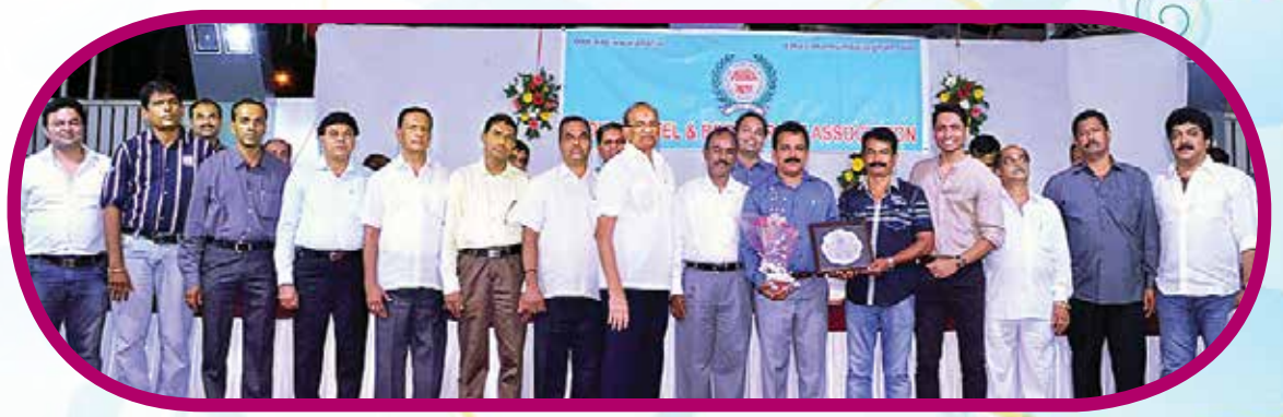
Zone - X : For the month of October 2014