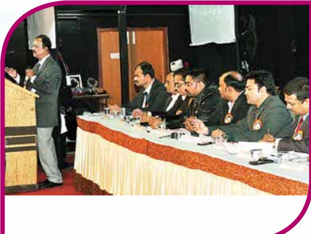
Power Point Presentation by President