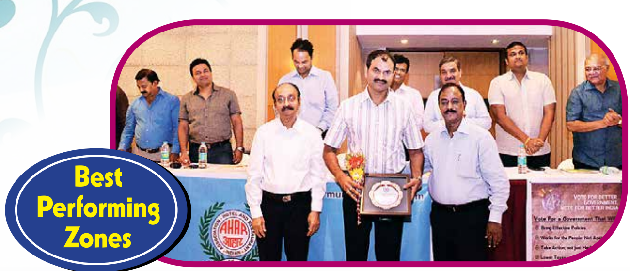
Zone - I: For the month of April 2014