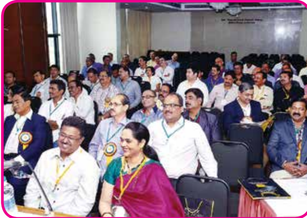
Attentive Audience at Seminar

Office bearers from fellow Associations addressing the gathering at the panel discussion and interactive session.