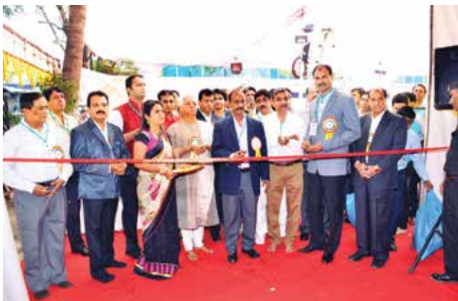
Inauguration of Restaurant Business Trade Show.