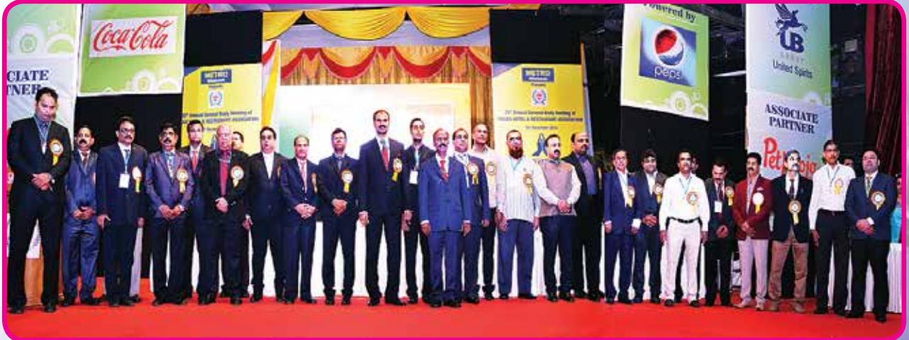
Office Bearers & Sub Committee Chairmen