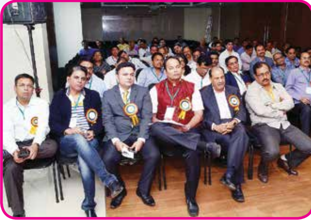
Attentive audience at Seminar on Staff welfare.