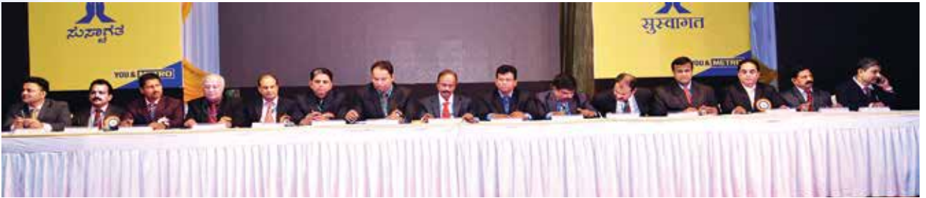
Office Bearers at the Dias