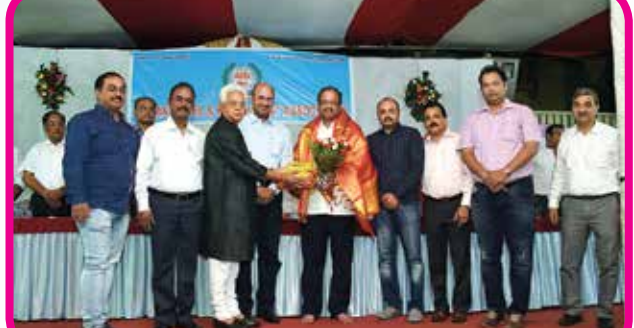
Shri Gopal Shetty, MP been felicitated for his support to the Hotel Industry.