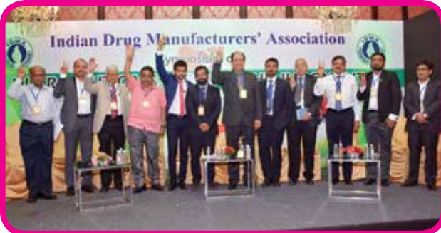
A Victory sign against FSSAI rules by IDMA supported by AHAR.