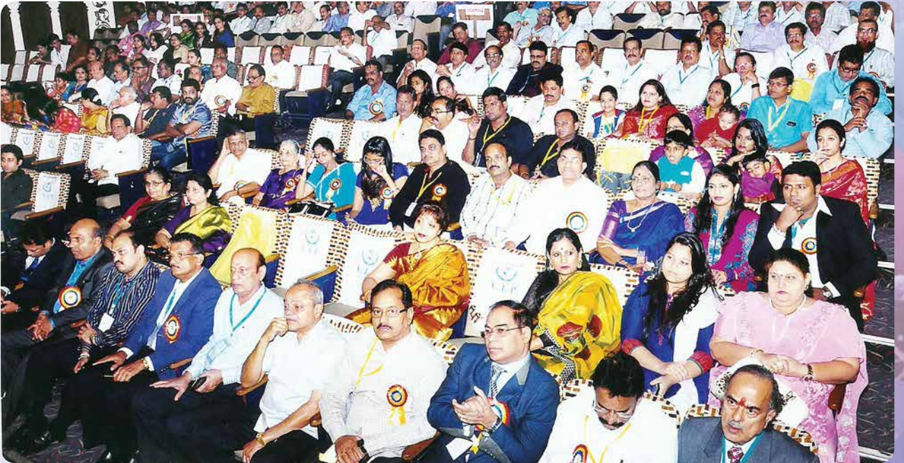
Attentive crowd at the Annual General Body Meeting