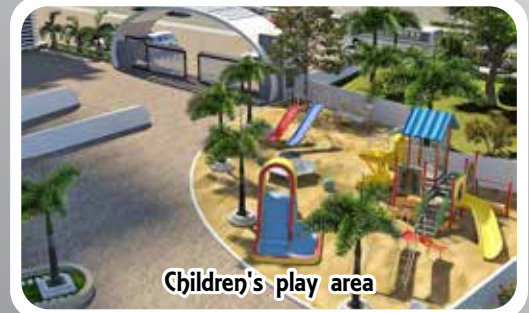
Children's play area