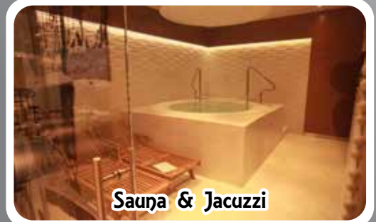
Sauna & Jacuzzi