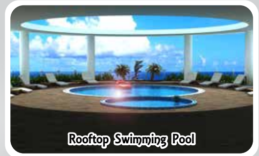
Rooftop Swimming Pool