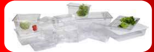
PC GN Pan