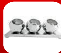
Pani Puri Matka