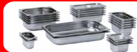
Steel GN Pan