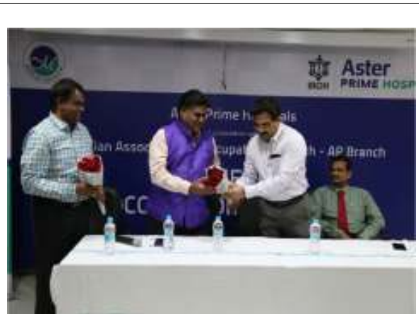
Presentation of bouquets to dignitaries