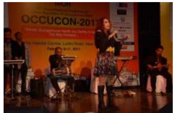
Cultural Programs , Occupational Health Quiz & Panel Discussion on BOHS Chaired By Director General Health Services Govt. of India