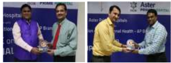
Presentation of Mementoes to