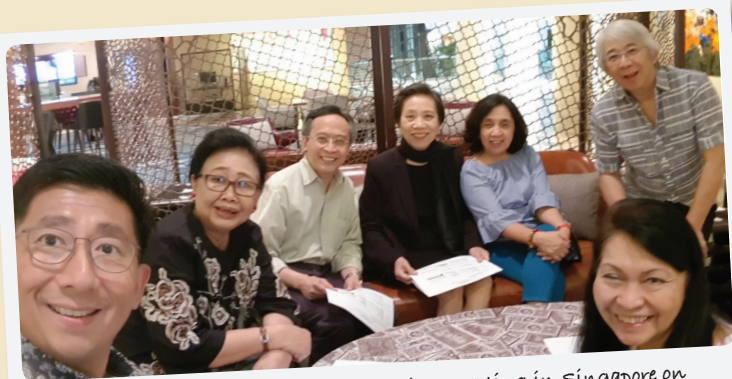
International organising committee meeting in Singapore on 5 March 2018