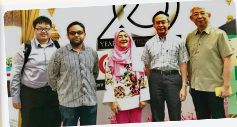
Part of local organising committee after meeting on 10 June 2018