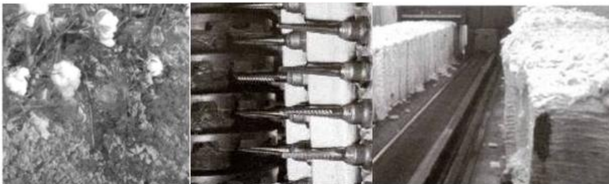
Contamination due to Plastic

In this system the contaminated material is removed because of gravity only. In this method of detection of cotton contaminants, a mechanical model is used. For the vision system and the sorting system, synchronized with the movement of cotton on the conveyor, an encoder is installed at the shift of the conveyor and driven by the belt. In this system only heavy contamination can be removed. Efficiency of this system is less due to lot of mechanical parts.