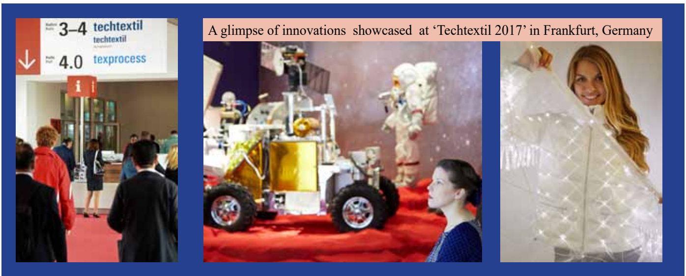
A glimpse of innovations showcased at 'Techtextil 2017' in Frankfurt, Germany