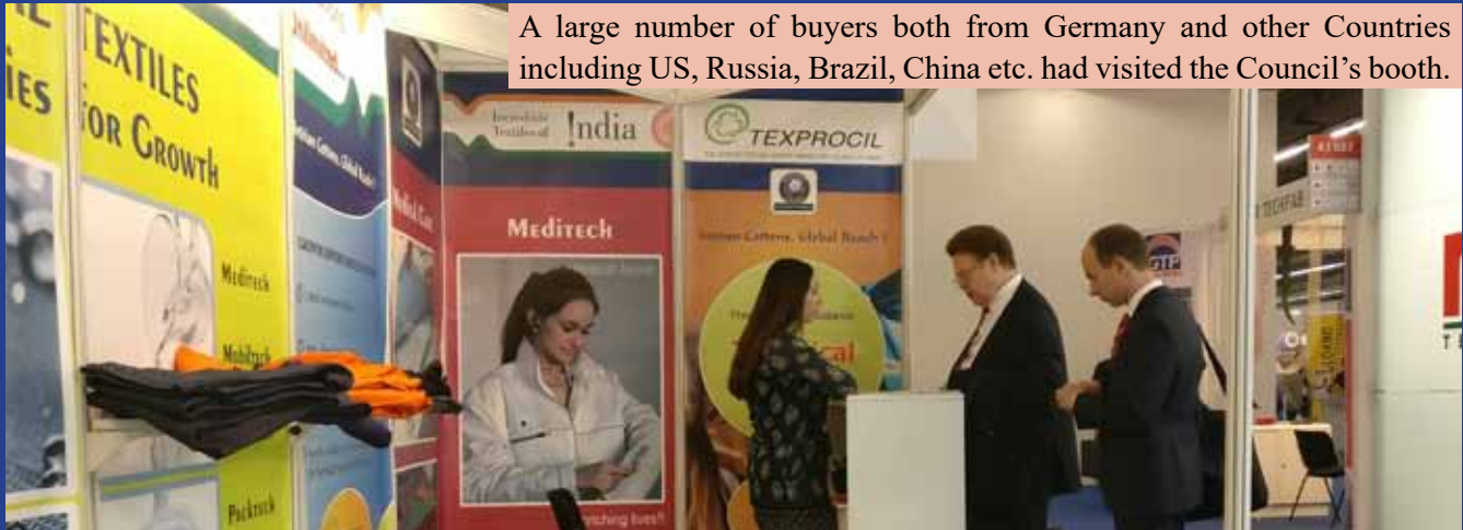
A large number of buyers both from Germany and other Countries including US, Russia, Brazil, China etc. had visited the Council's booth.

The Council had participated in Techtexsil 2017 held in Frankfurt, Germany from May 9-12, 2017. Techtexsil, Frankfurt is a leading international trade fair for technical textiles and nonwovens showing the full range of potential uses of textile technologies.