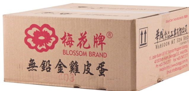
Century Egg (Chicken) 60 Eggs/Box