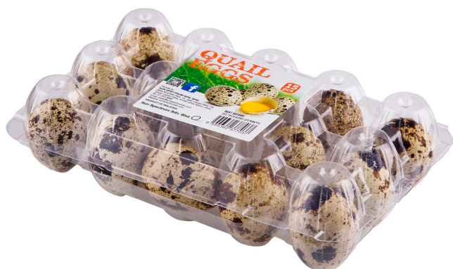
Quail Egg 15 eggs/pack