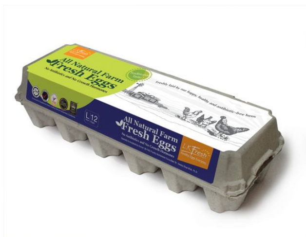
Liang Kee All Natural Egg 12 Eggs/Pack