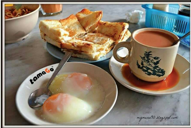
Tamago Half-Boiled Egg TC-50, TC-100

Model TC-50 Voltage 220-240 Frequency 50 Hz Capacity maximum 50 eggs Heater Element 1.2KW Energy Usage per process Approx 0.6 KWH