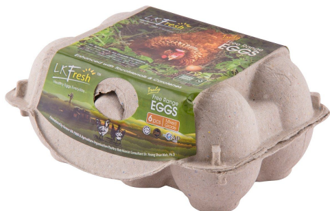
Liang Kee Free Range Egg 6 Eggs/Pack