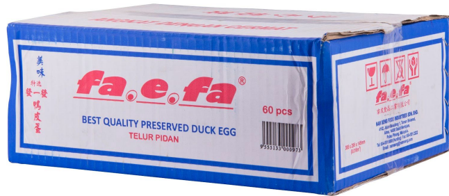
Century Duck Egg 60 Eggs/Box