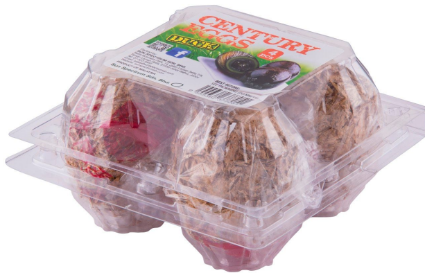
Century Egg 4 Eggs/Pack