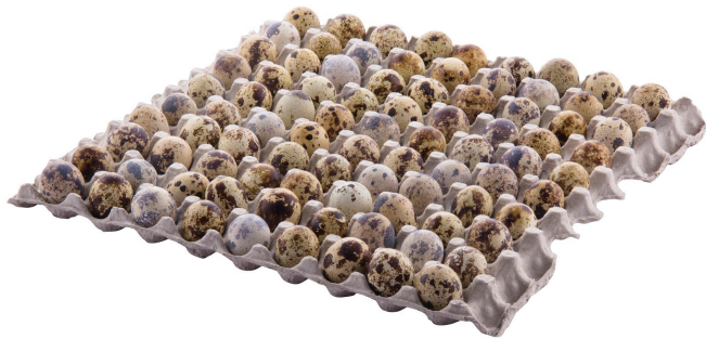
Quail Egg 90 Eggs/Tray