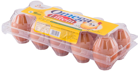
Happy Egg Omega Lutein 10 Eggs/Pack