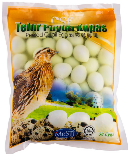
Hard Boiled Quail 50 eggs/pack