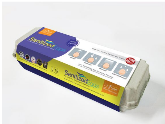
Liang Kee Sanitized Egg 12 Eggs/Pack