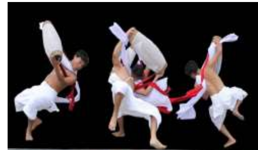
Pung Cholam Drum dance (Manipur)