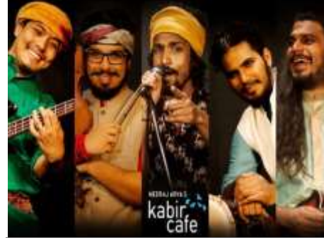
Kabir Café (Mumbai)