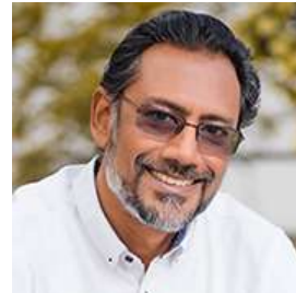
Nilanjan Bhowal Design Consortium