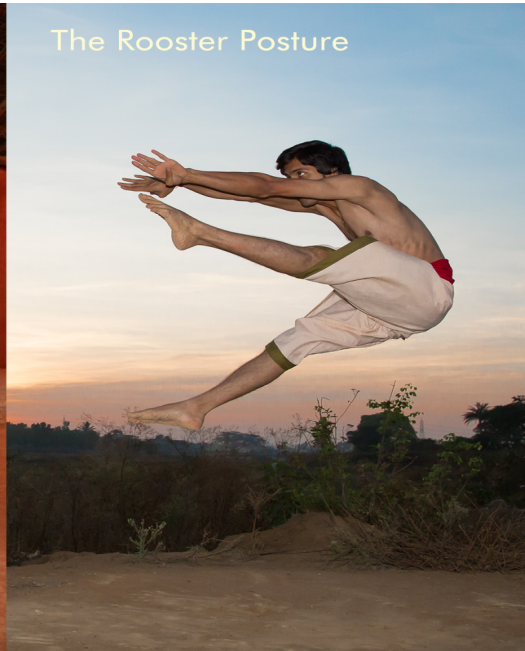
The Rooster Posture