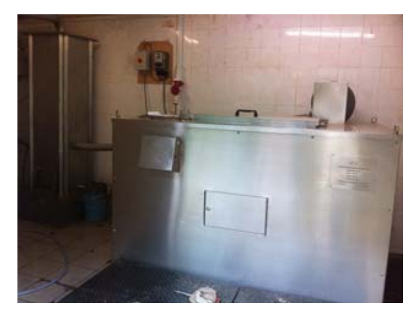
APPENDIX 1: PHOTO OF BIO-MATE COMPOSTING SYSTEM