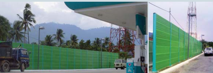
Acoustic Barrier at Padang Rengas

Attenuation due to barrier is related to how much further the sound is forced to travel in going around the screen compared with the direct path. The important quantity is the extra distance \delta , as given in the formula \delta = A + B - d