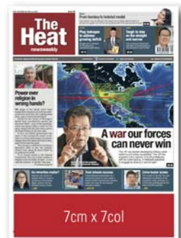
Front Page Panel