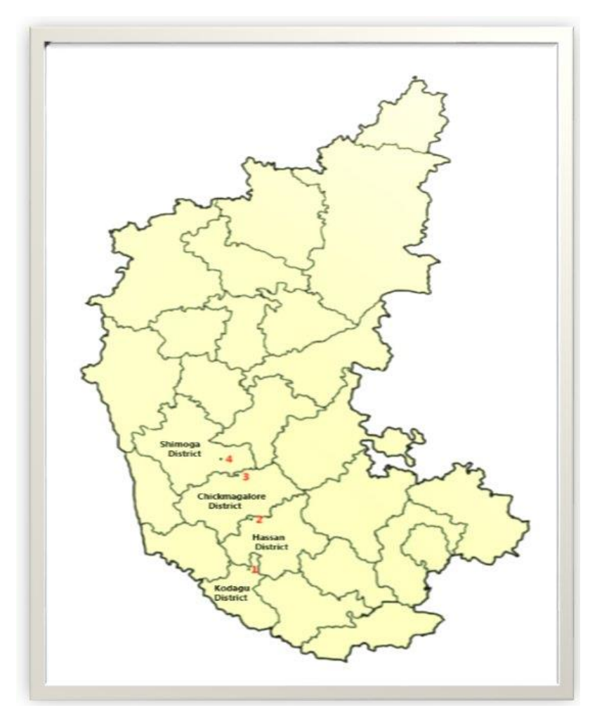
Fig. 1.1- Map showing the study area of four artificial tanks in the Western Ghats region of Karnataka state.