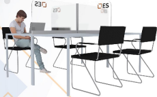
Table Partition RM 80/per meter