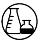
Colourants & Chemicals