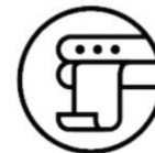
Printing & Inks