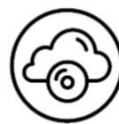
Software & Automation