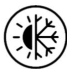
Plant Ops Equipment