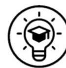
Research & Innovation