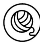
Fibres, Yarns & Fabrics