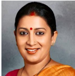
Smt. Smriti Irani Hon'ble Union Minister for Textiles