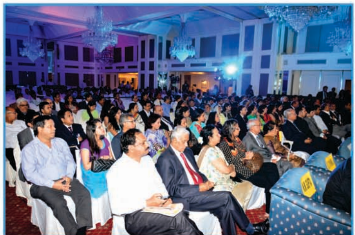
View of the audience at the Export Award Function of the Council