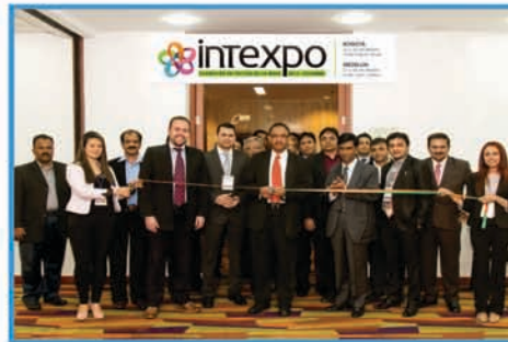
Shri Sajeev Kurup Babu, Counselor of Embassy of India in Bogota inaugurating the Exhibition in Bogota, Colombia