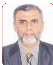
Aziz Valiulla Kausar Textiles