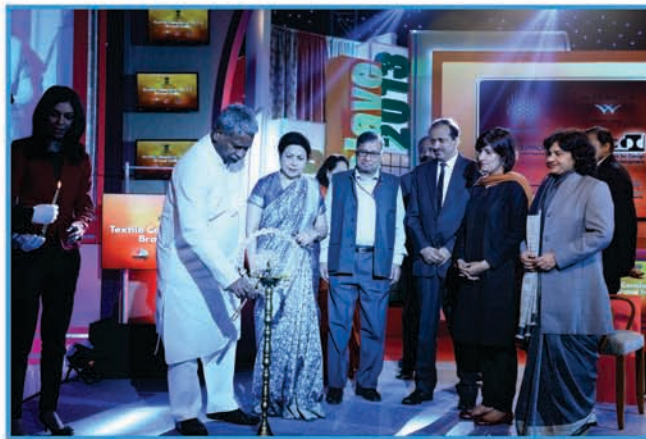
Hon'ble Union Minister of Textiles, Dr. Kavuru Sambasiva Rao lighting the lamp at the Inauguration of Textile Conclave