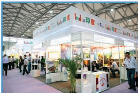
View of the Indian Pavilion at Intertextile Shanghai Apparel Fabrics, China