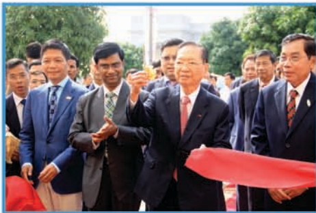
Mr. Kiti Setha Bandit Keat Chhon, Hon'ble Permanent Deputy Prime Minister of Cambodia inaugurating the 8th Cambodia Import Export & One Province One Product Exhibition 2013 in Phnom Penh