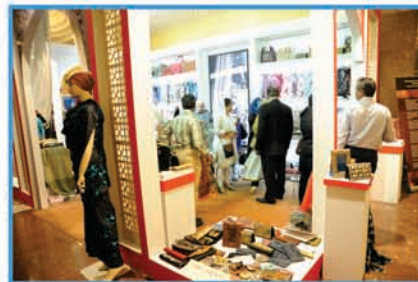
View of the Theme Pavilion at INTEXPO