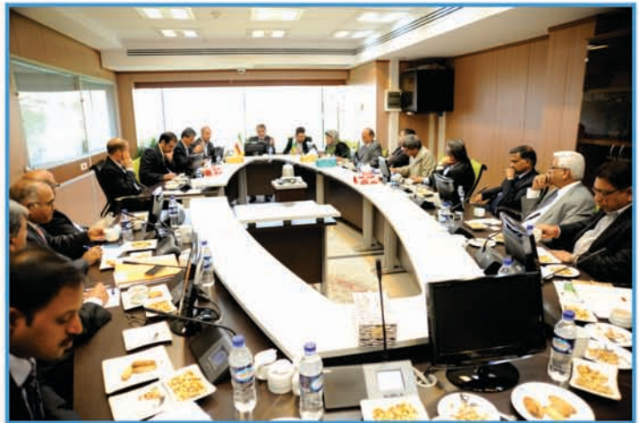
Meetings of the Delegation with Association of Iran Textiles Industries (AITI) and Tehran Chamber of Commerce, Industries & Mines in progress