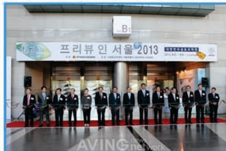
A view of the Inaugural Function of Preview in Seoul 2013, Korea