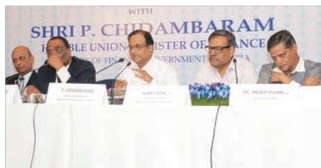
Hon'ble Union Minister of Finance, Shri P. Chidambaram speaking during Interactive Meeting in Mumbai