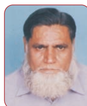
Gulam Mohamed S. K. Exports