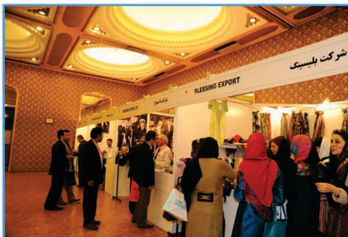
View of the stalls at INTEXPO