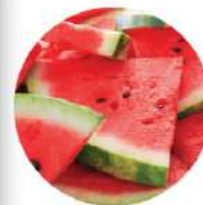
2 watermelons (vitamin B-6)