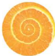
2 oranges (vitamin C)