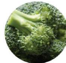
3 broccoli stalks (iron)