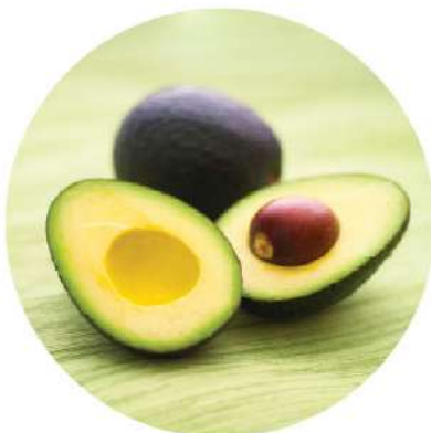
9 avocados (vitamin E)