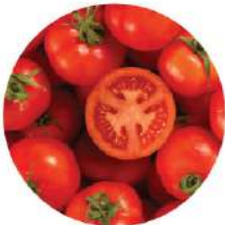
61 c. of tomatoes (folate)