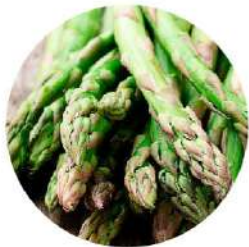
100 stalks of asparagus (niacin)