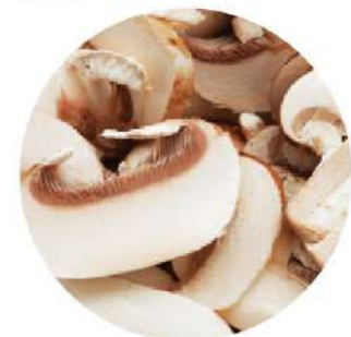
37 mushrooms (pantothenic acid)

*These statements have not been evaluated by the Food and Drug Administration. This product is not intended to diagnose, treat, cure or prevent any disease.