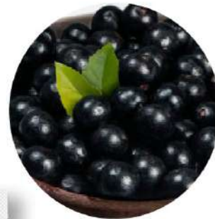
90 acai berries (ORAC value)