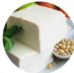
5 pieces of tofu (vitamin B-12)