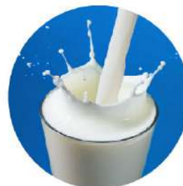
6 cups of whole milk (vitamin A)