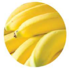
19 bananas (riboflavin)