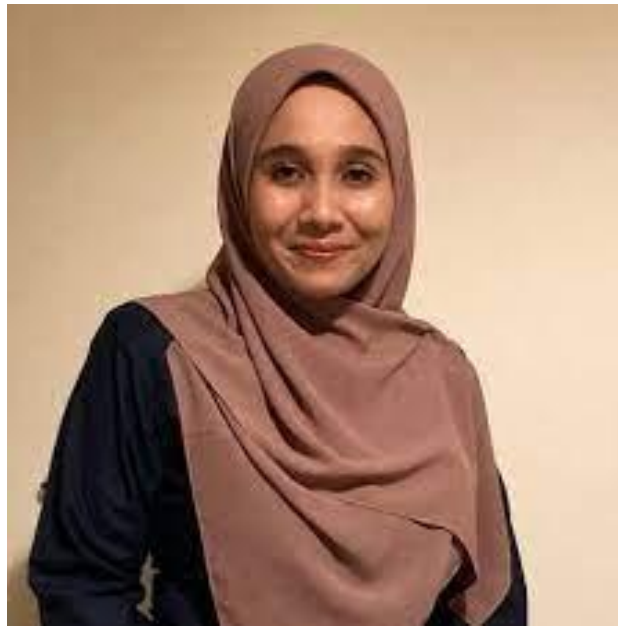
Dietetic Officer at Hospital Selayang, Malaysia