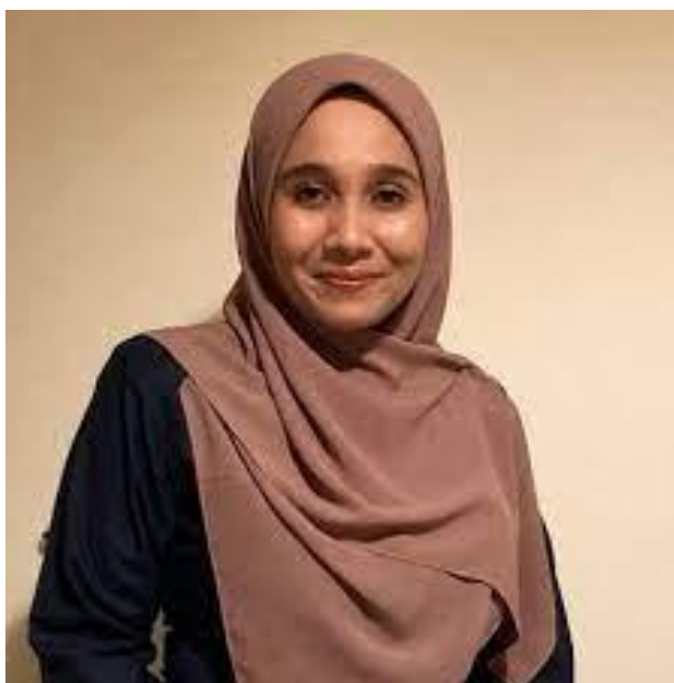
Dietetic Officer at Hospital Selayang, Malaysia