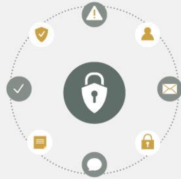
Information Security Governance Committee