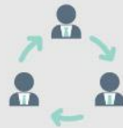
Threat Intelligence Sharing