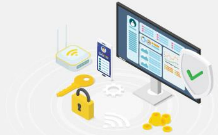
undertaken numerous information security projects to enhance its security operations