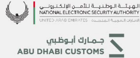
National Electronic Security Authority UEA IA And the maturity level reached across Abu Dhabi Customs is 95%.