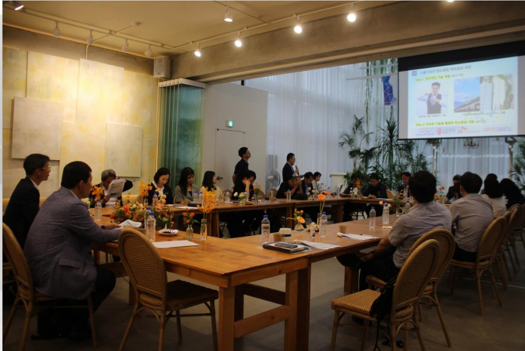
Quarterly Meeting of Customs Business Support Centers where green customs strategy was discussed (September, 2023)