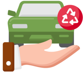
Used Vehicle Export