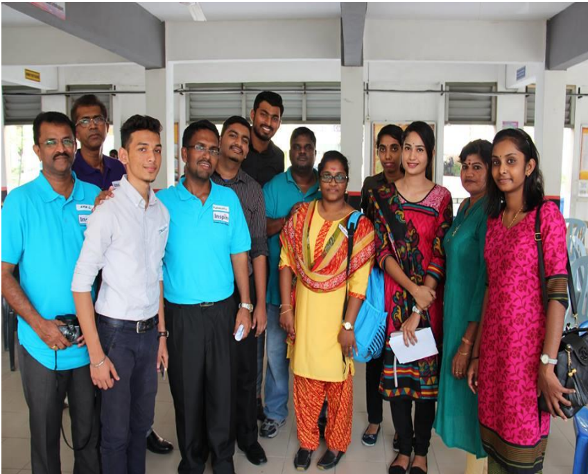
The IFA 2017 recipients