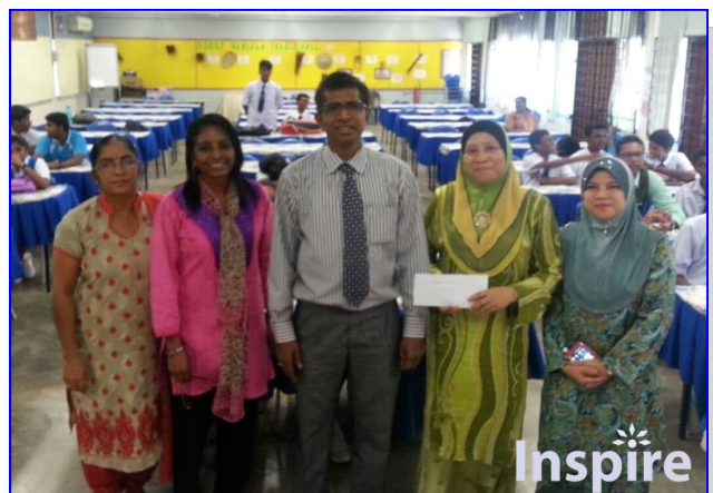
SEKOLAH SAAS SHAH ALAM