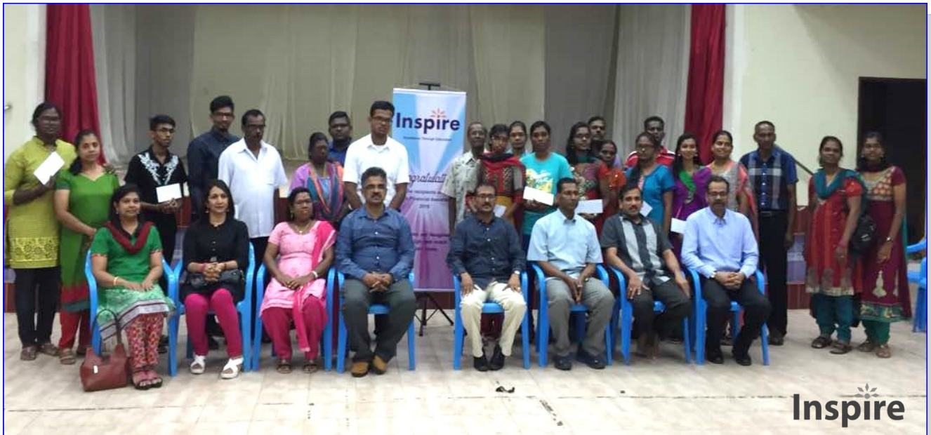
IFA 2016 recipients and Inspire members at the cheque handover ceremony in Johor Bahru on 23 August 2017