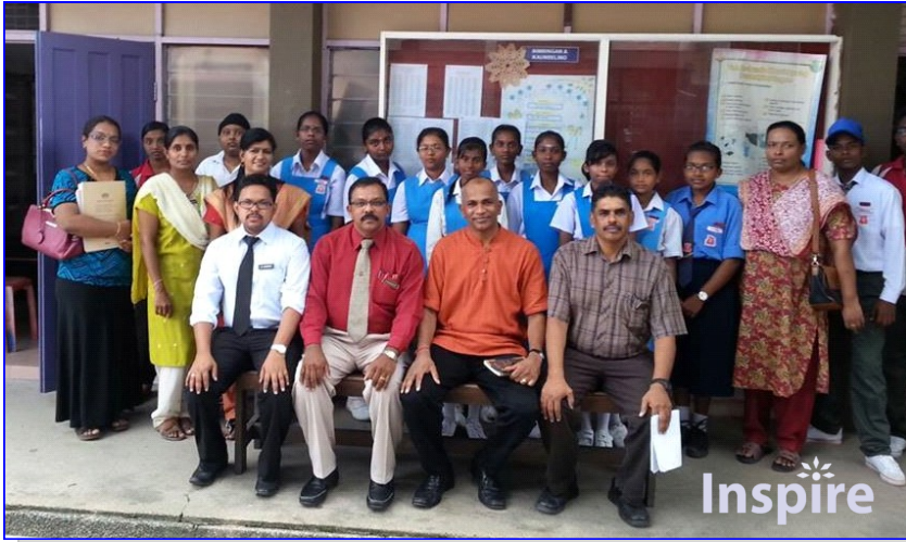
SEKOLAH MENENGAH AMBROSE

Identified needy students in several schools and provided school uniforms, school bags and school shoes.