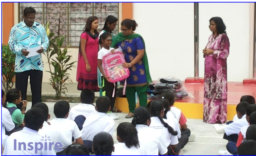
SJK(T) LADANG RESAK BUKIT SUBANG