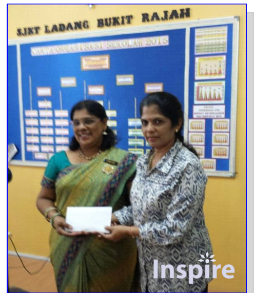
SJK(T) LADANG BUKIT RAJAH