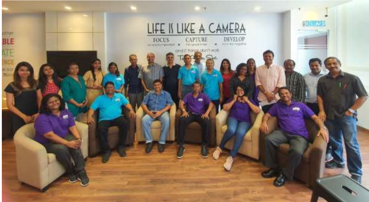
Inspire 5 th AGM, 8 March 2020