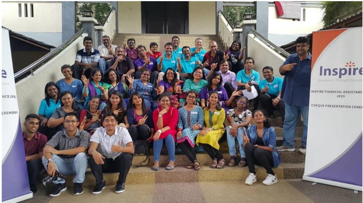
The Inspire members and well-wishers who took care of things during the ceremony