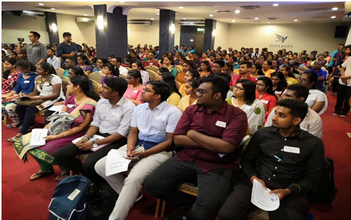
Some of the student-recipient of IFA 2019