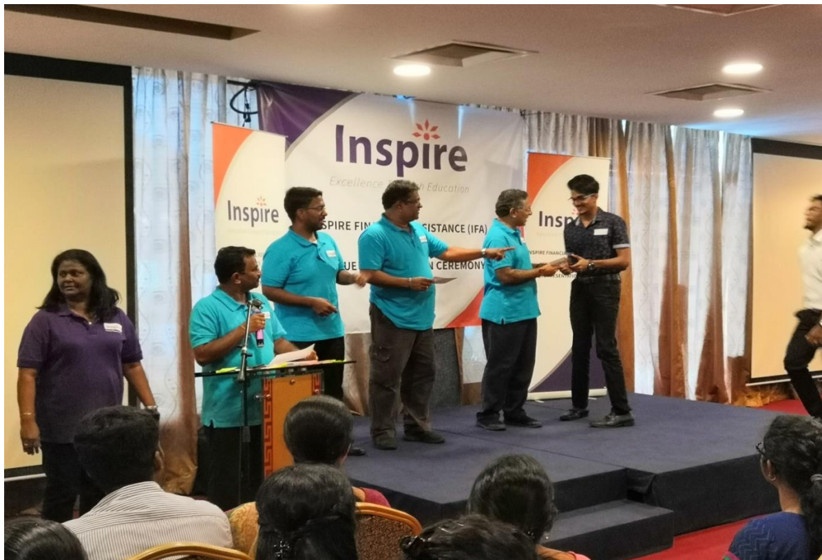
The cheque-giving ceremony in progress

The following pictures were taken during the IFA2019 cheque-giving ceremony: