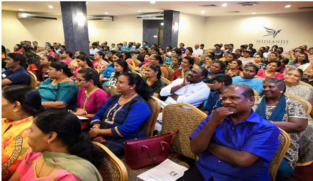
Parents of the recipients turned out in full force too