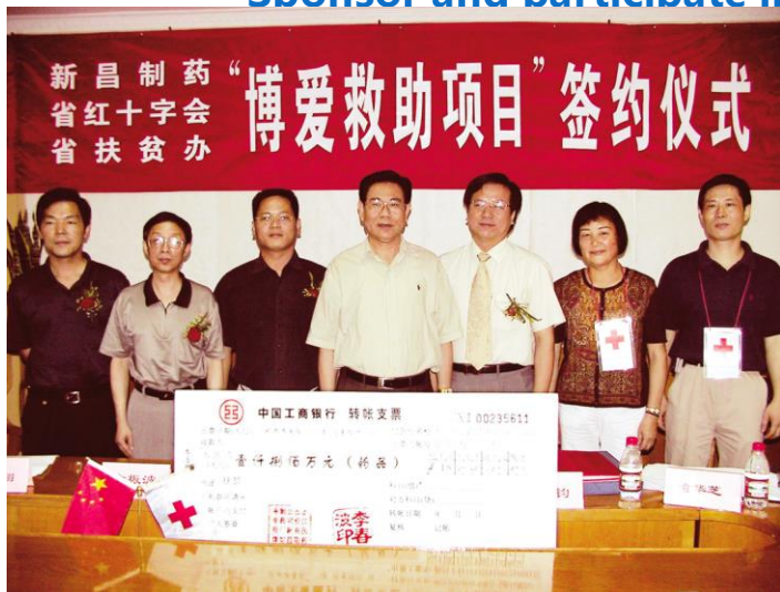
浙江省红十字会&省扶贫办 “博爱救助项目”签约仪式 Red Cross Society & Poverty Alleviation Office of Zhejiang Signing Ceremony of Bo'ai Aid Project

Sponsor and participate in charitable activities, raise public awareness of health and disease prevention