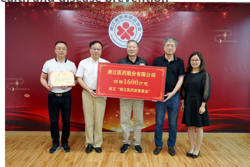
冠名设立浙江省慈善联合总会 “浙江医药慈善基金” Titled establishment of Zhejiang Medicine Charity Fund in Zhejiang Provincial Charity Federation