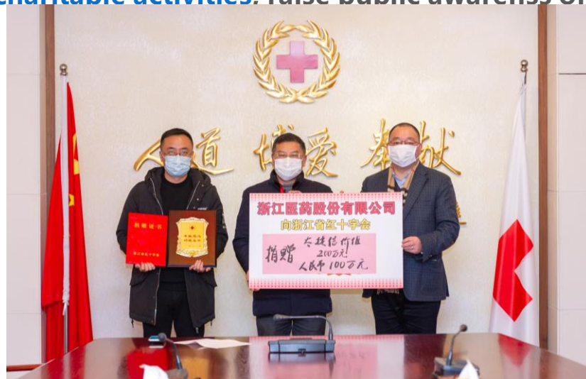
新冠疫情期间, 捐赠药品和善款 Medicine and financial donations during Covid-19 pandemic