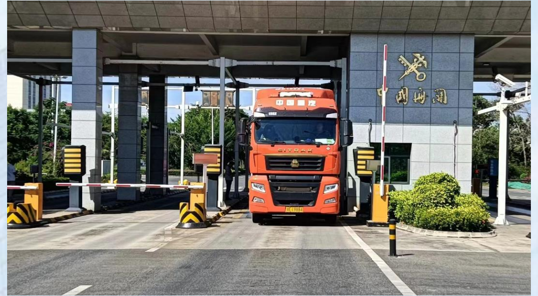
First Guarantee-free Rapeseed Oil Shipment Clears Customs Guarantee-free Rapeseed Oil Successfully Leaves the zone

The policy of the General Administration of Customs, "Announcement on Supporting the Exemption of Guarantee for Senior Certified Enterprises in Comprehensive Bonded Zones for Sending and Collecting Newspapers", reduces the cost and increases the efficiency for the enterprises, and assists the enterprises in high-quality development.