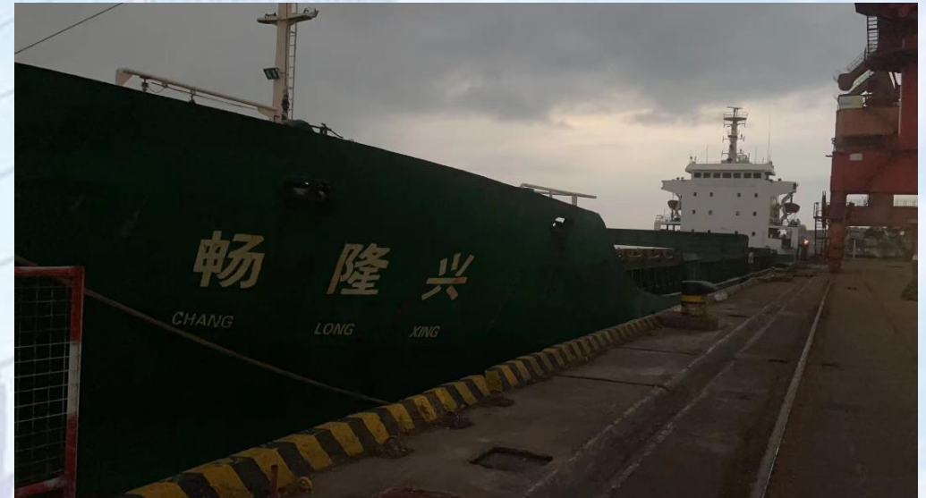
First Guarantee-Free Canola Meal Shipment