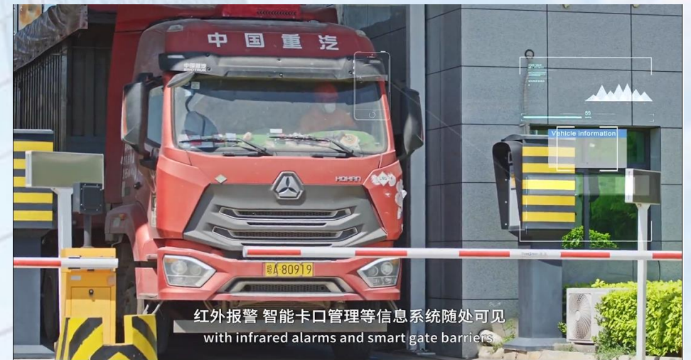
Smart Gate Barriers In Yangpu Free Tariff Zone