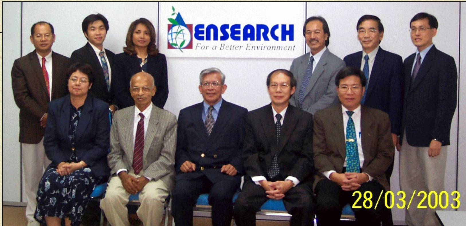
With Ensearch Council Members 2002/2003