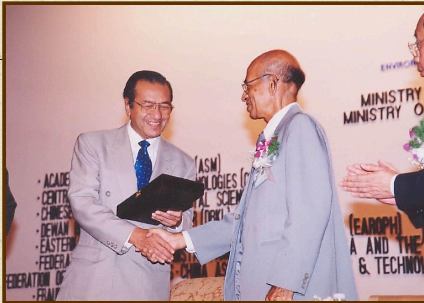
Presenting the Memento to the PM