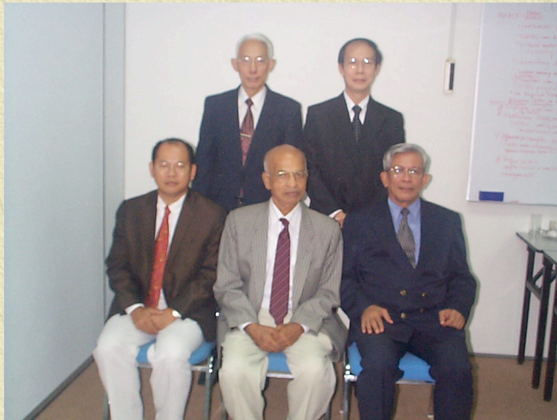
CETEC Board of Directors