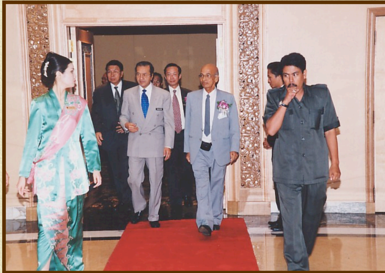
Welcoming the Prime Minister Datuk Seri Dr. Mahathir Mohammed