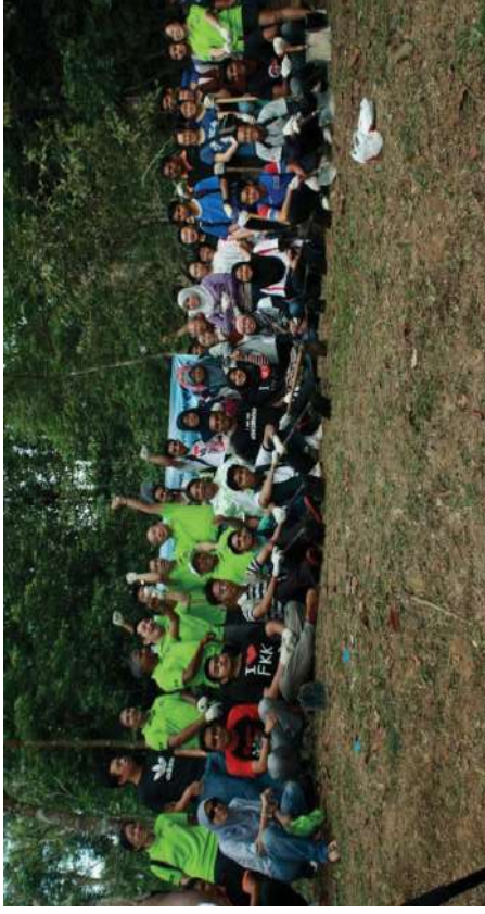
IEM Tree Planting at Taman Botani Shah Alam (24 th June 2012)