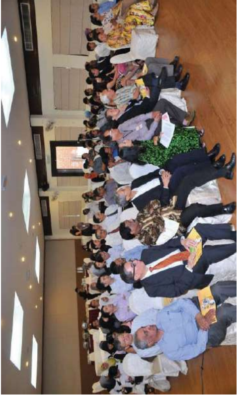
A total of 78 members attended the KKEF Memorial Public Lecture held at Kelab Golf Negara Subang on 8 th November