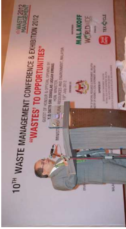
Guest of Honor for day 2 of WM2012, Y. Bhg Dato' Sri Douglas Uggah Embas, Minister of Natural Resources and Environment, Malaysia