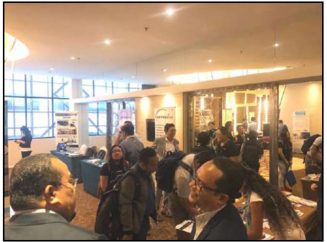
1. CEMS Seminar