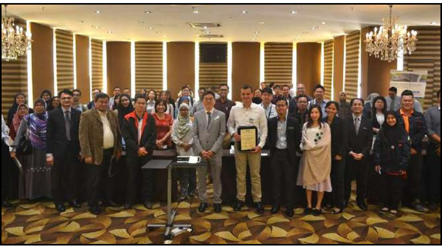
A group photo session during Seminar on "Application of Continuous Emission Monitoring System (CEMS) as an Environmental Management (EM Tool for Guided Self-Regulations (GSR)".

Appreciation goes out to all who were involved in one way or another in making this a memorable Seminar & Exhibition akin to a Conference! This turned out to be the largest event for the year. ENSEARCH aspires to organise such events to bring value to our members, supporters and the community.