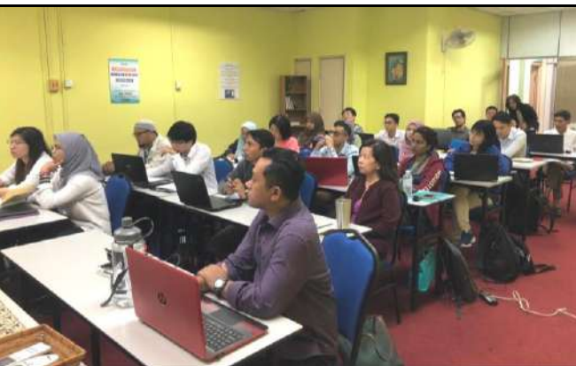
2. Participants of QUAL2K River Water Quality Modeling Training