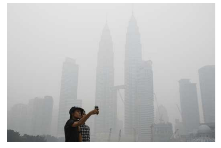
Malaysia's poor air quality was first associated with the haze in 1983, which caused severe distruptions to life

The World Health Organisation had reported that air pollution caused 6,251 deaths in Malaysia up to 2012.