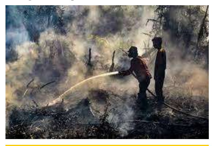
Firefighters extinguish a fire at a peat land forest in Payung Sekaki regency in Pekanbaru, Riau province, a province on Indonesia's Sumatra island

At the 21st Technical Working Group and Sub-Regional Ministerial Steering Committee Trans-boundary Haze Pollution meeting recently, Malaysia presented measures taken to prevent haze and open burning.