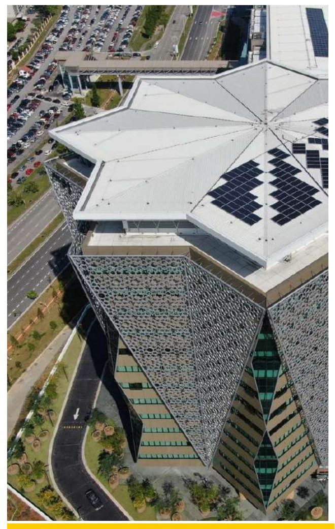
Architectural masterpiece that is inspired by the traditional songket concept intricately woven together to form a beautiful star-shaped building.

To begin with, strategic interventions have been made in corporate diversification. Guided by the UN Sustainable Development Goals, adopting the core principles and values where safety and environmental concerns are of utmost priorities in construction management. The adoption of these ESG targets is praiseworthy. While some targets are achieved, I must say that it brings me struggles as an ESH practitioner. It is a valid argument that ESH division is a non-revenue generating department. Transition in ESH division is imminent because businesses will still be evaluated based on financial metrics such as revenue and profit.