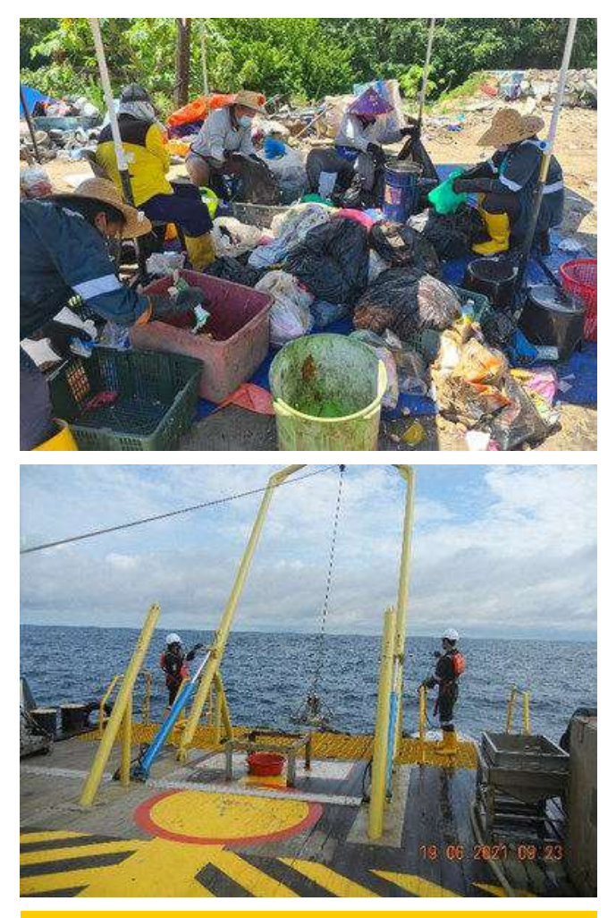
EMS Progress Sdn Bhd, working on waste characterization study and offshore sediment sampling

EMSP advocates to keep-safe the natural resources and minimize its adverse impacts by implementing a structured planning and focus on social environmentally – sensitive approach. It is our belief that development, people and nature should complement and strengthen each other, not deteriorating one another.