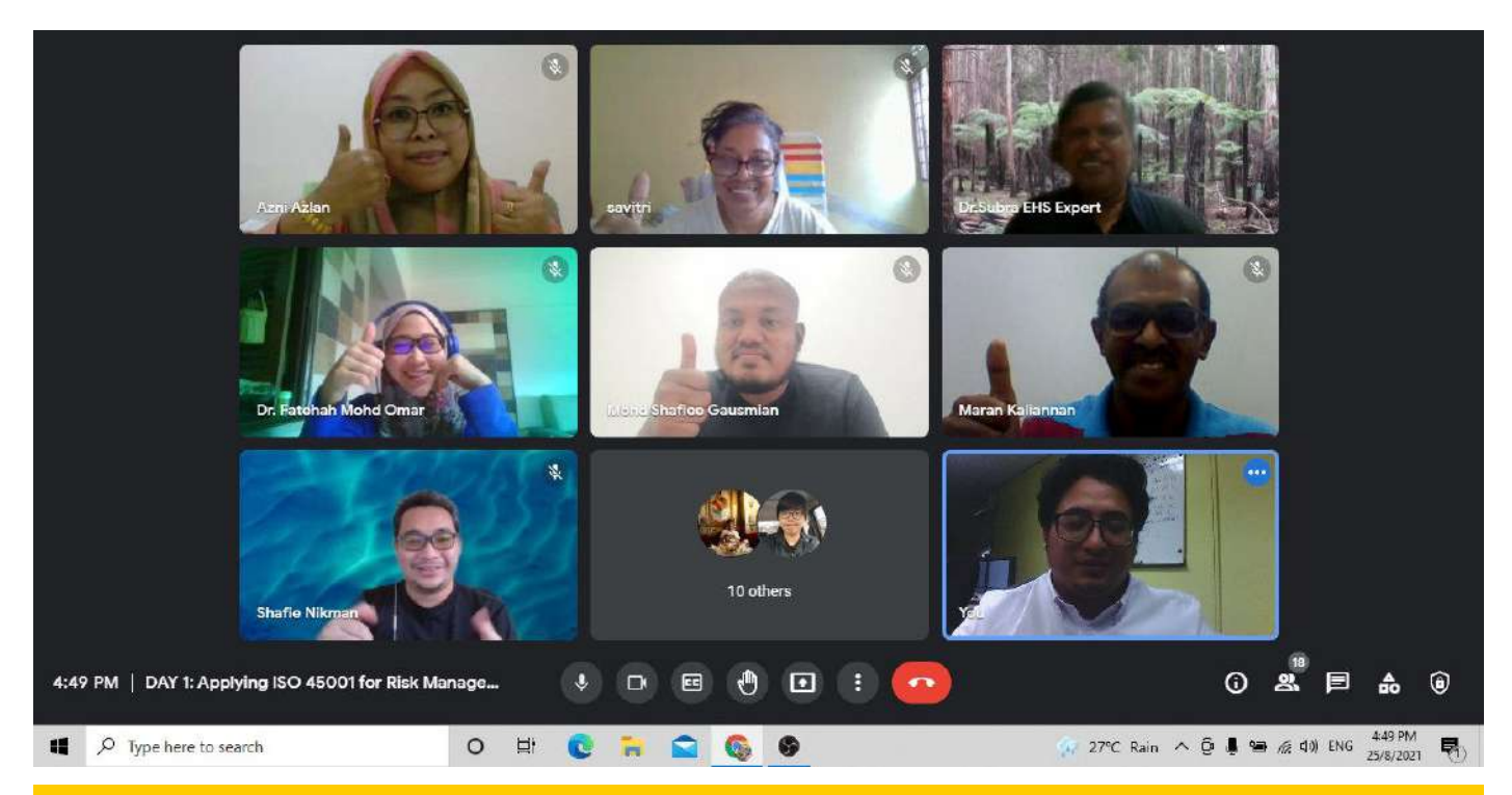
Some of the participants during Day 1 of training. His interactive quiz and assessment were excellent and participants were also given chances to do presentations.

The question and answer session was very active with the curious participants asking back to back questions. Even so, Dr Subramaniam managed to answer all the questions accordingly. The training was granted 12 CPD hours from Department of Environment (DOE) and also HRD Corp claimable.