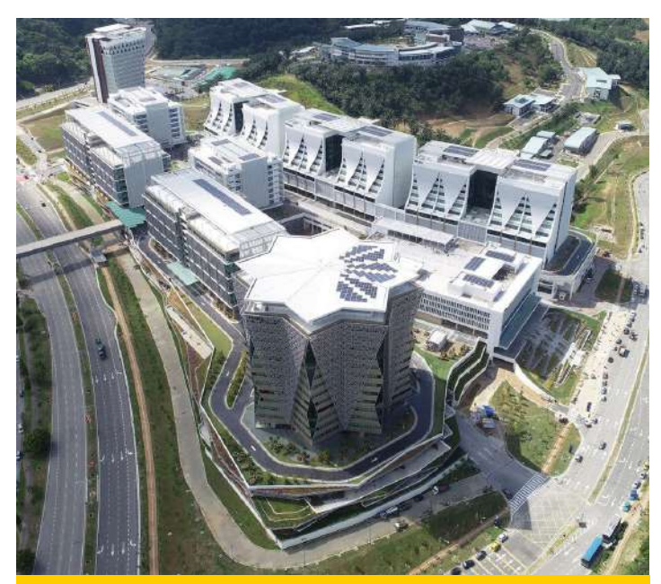
Parcel F (Putrajaya), the RM1.4billion design and build project completed on time by Sunway Construction with outstanding achievements using BIM system.

The values of resources are calculated directly based on physical capital such as materials, and machinery as well as human capital (e.g. staff competencies, capabilities). There is another category of indirect resources which are expected to be rewarded with intangible financial returns are intellectual capital (e.g. system, process), and relationship capital like reputation and branding.