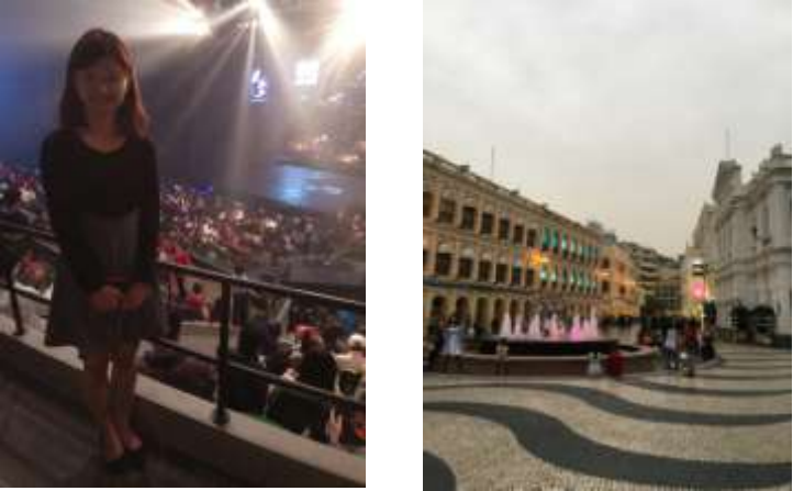
Musical concert and Macau