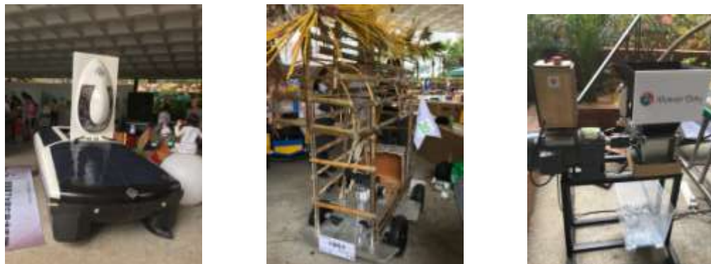
Solar car , eco car by bamboo and plastic recycle machine at maker fair