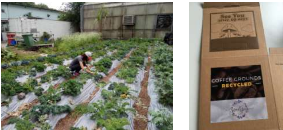
Farming and recycled coffee ground mushroom packs.

I was given chance to learn organic farming with Ms Hermia from Foodcycle+. Foodcycle+ not only grows organic vegetables but also they make mushroom cultivation packs by collaborating with café and collect their waste coffee ground and turn it into this beautiful mushroom packs shown below.