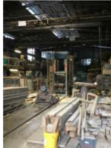
Wood making factory

Lastly, we also went to a pig farm where the farm owner carefully explains the life cycle of the pig to us.