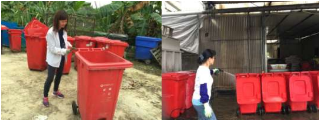
Repairing and cleaning the dustbin to collect potato skin from Calbee

We were appointed by Calbee as their service provider to collect their waste potato skin.