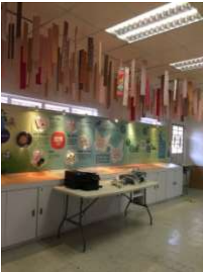
Some of the eco products that they are selling