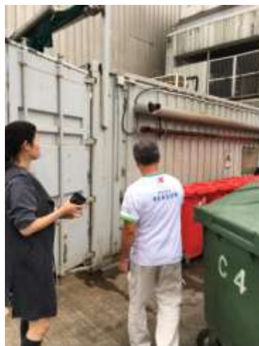
Site visitation and discussion with representative of Calbee on the disposal of potato skin