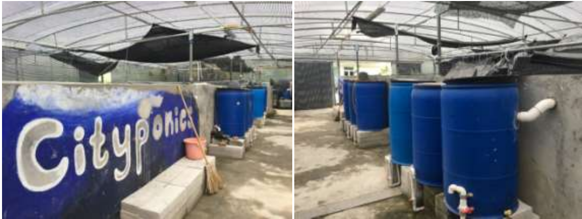
Fish pond in Cityponics