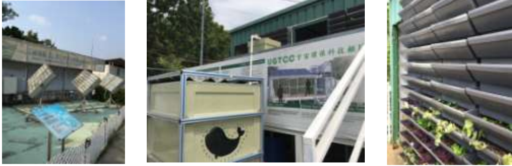
Solar systems and vertical farming in E5 Campus