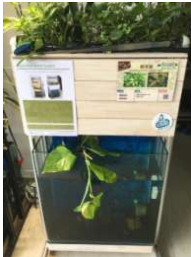
Mini Hydroponics System by Cityponics. Suitable for family use.