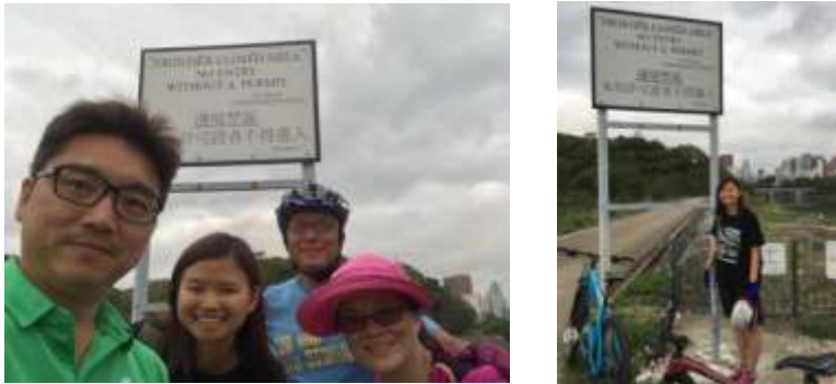
Photo at the borders of China and Hong Kong