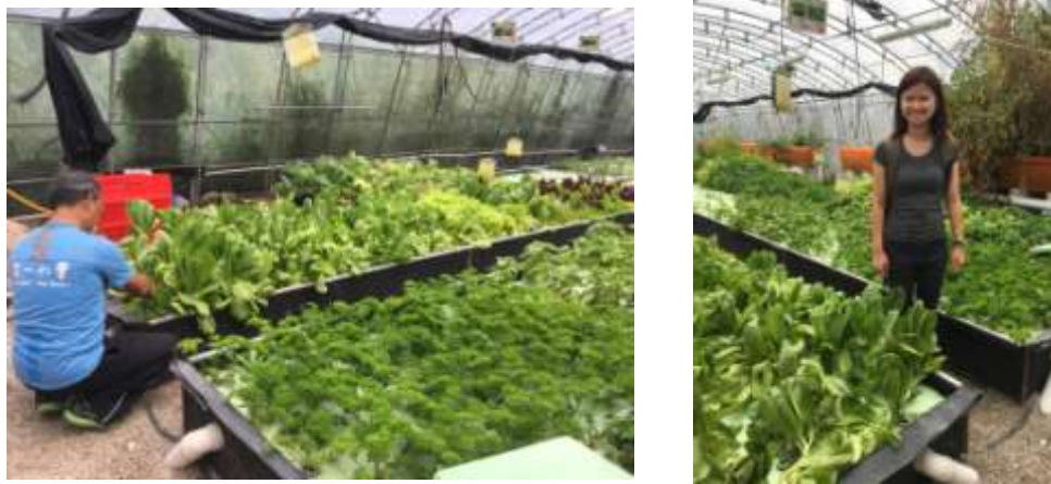
This is the vegetables farm grown using the nutrients from the Fish pond as shown above, Mr Eddie checking the water pumping system of the vegetables.