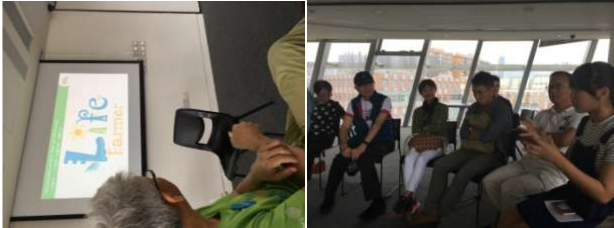
Life farmer seminar and sharing session by previous participants

workshops, sharings, and ten “Makers’ Day” in different neighbourhoods. They are promoting “Maker Culture” to the general public, demonstrating creativity, inventiveness and resourcefulness.