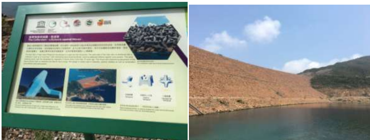
Water reservoirs and explanation of the shape of rocks they used to protect the reservoir