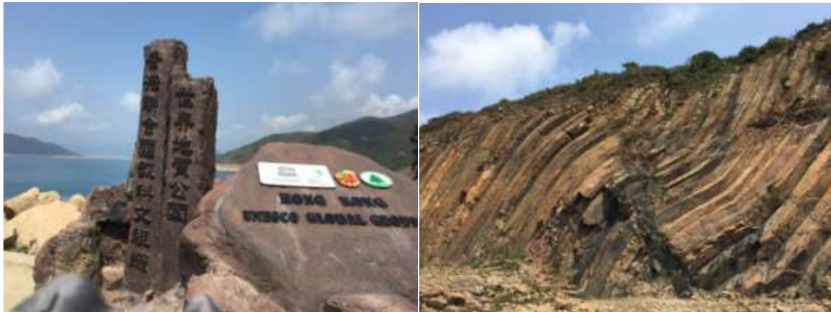
Unique shapes of rocks at geopark

I also learnt how different types of rocks and shaped form in this geopark with the clear explanation by Mr Eddie.