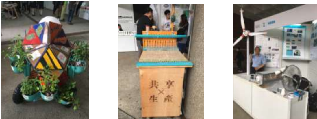
Exhibitions at Maker fair, plastic weaving machine, wind turbine