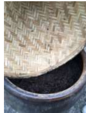
Traditional Soy sauce maker factory