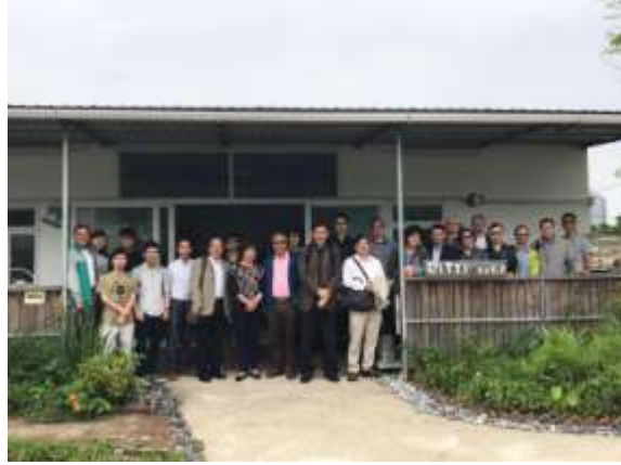
Photos together with officials from Ministry of Education at Cityponics