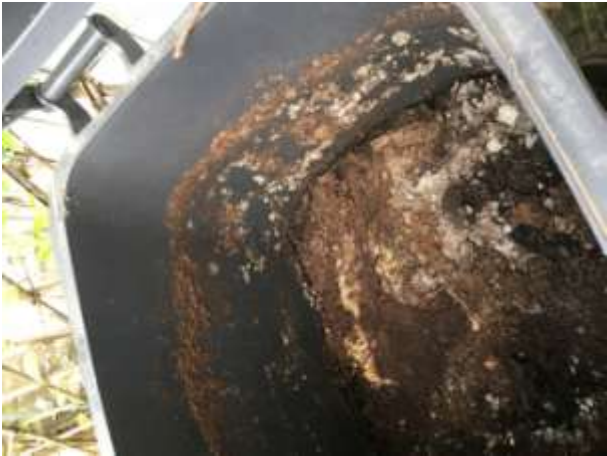
Educational exhibit materials and black soldier flies they fed using food waste.