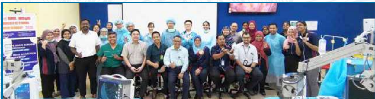
Group photo with the Temporal Bone Course Moderators, Participants and Organising team