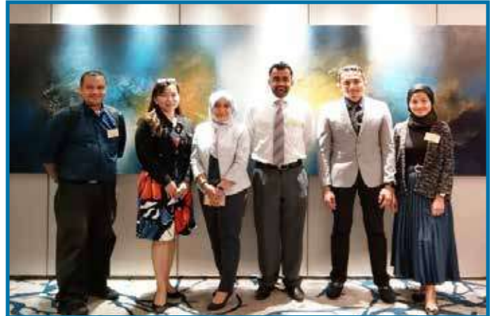
Panel of speakers in Sabah

At the end of the event, the participants were still very receptive and attentive. Post mortem with the crowd yielded good reviews and they hope that in future the lectures would go into great details in topics regarding emergencies in ORL. We hope that Sabah will be listed as regular venue for this annual symposium programme.