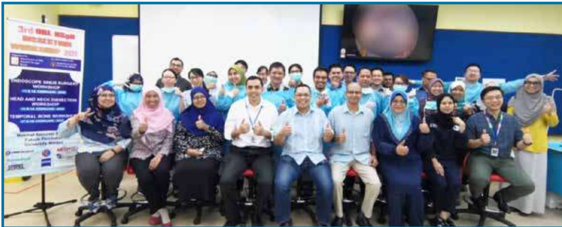
Group photo with the Head and Neck Dissection Workshop Moderators, Participants and Organising team