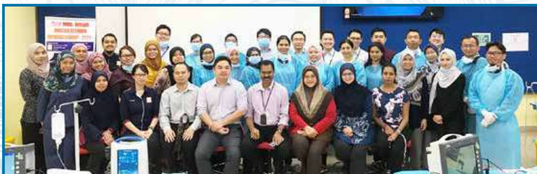
Group photo of the Endoscopic Sinus Surgery Moderators, Participants and Organising team