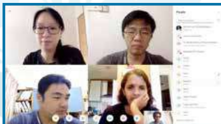
Pre-meeting testing of the ASM