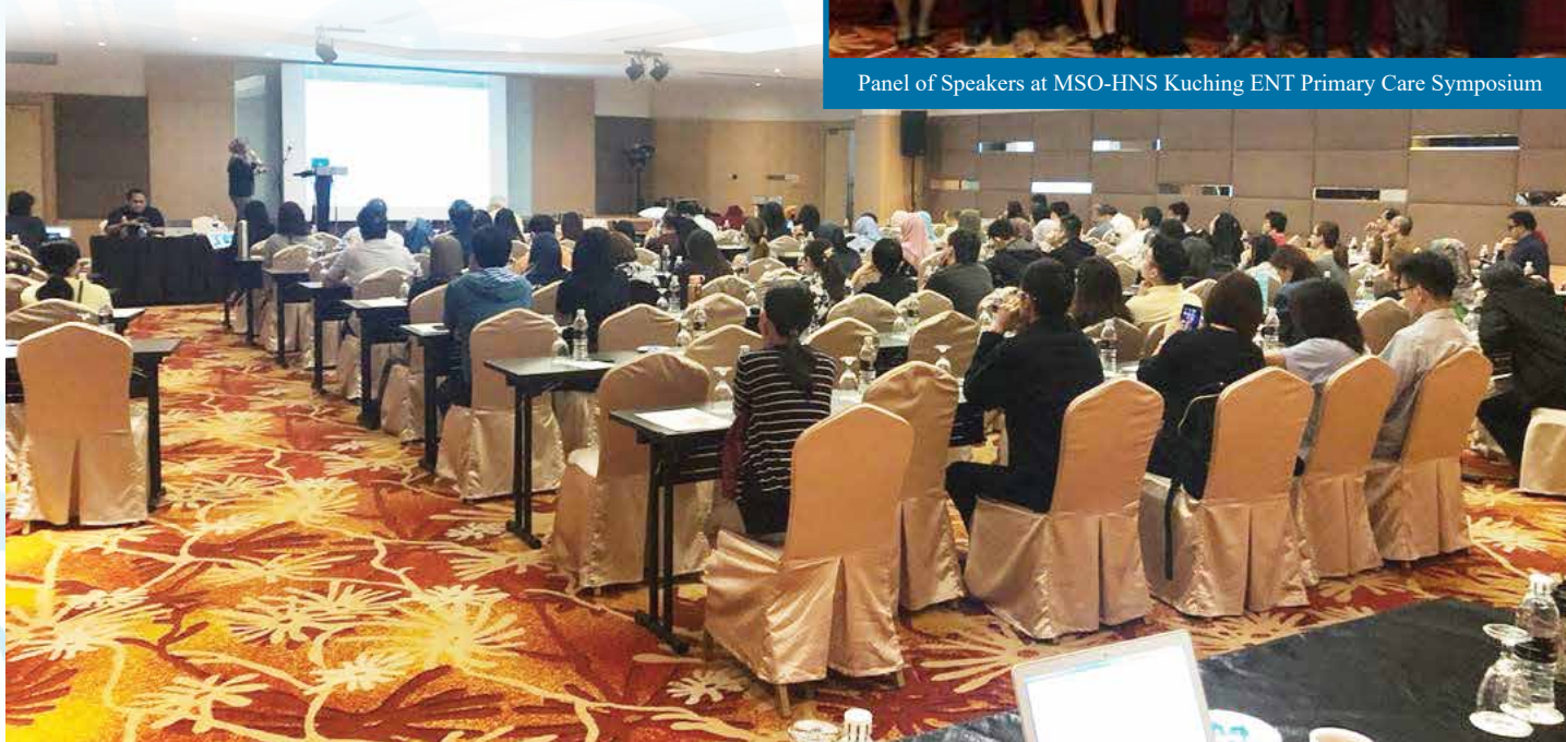
MSO-HNS Kuching ENT Primary Care Symposium at Imperial Hotel, Kuching, Sarawak