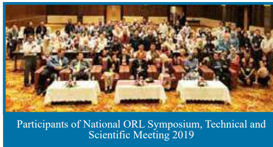
Participants of National ORL Symposium, Technical and Scientific Meeting 2019