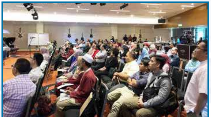
A total of 98 participants attended the MSO-HNS Penang ENT Primary Care Symposium at Hard Rock Hotel, Penang

We really hope this event can be organised annually.