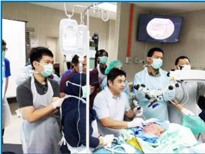
Temporal Bone Dissection Workshop

A total of 60 local and 4 international delegates participated in this course. Five local guest speakers and facilitators were involved in making the course a success. This course received very good feedback and comments from the participants.