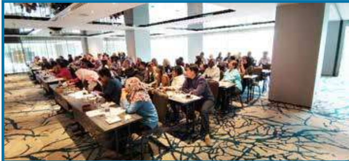
Participants in Sabah

The symposium drew 86 participants from the private general practitioner clinics and government clinics around Sabah. Some drove and flew in from out of Kota Kinabalu to attend this event, including one GP from West Malaysia.