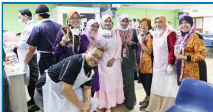
The Organising Committee of the workshop