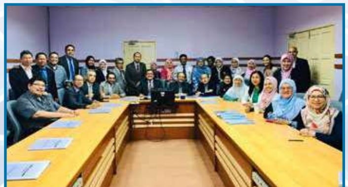
Examiners after discussing about the MMED ORL-HNS results