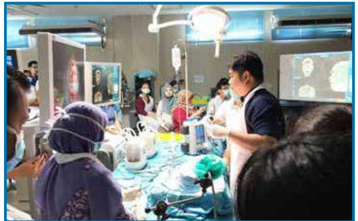
FESS & Advanced Skull Base Surgery Dissection Workshop