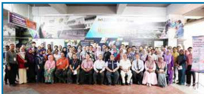
Speakers and participants of the workshop

We expressed our deepest gratitude to everyone involved in this excellent event, especially the moderators and the Organising Committee members who had given their full support and commitment. We hope that this course will continue to improve hands-on skills, anatomical and surgical knowledge of our local ENT trainees and young budding head and neck surgeons.