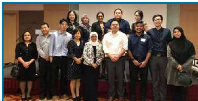
Panel of Speakers at MSO-HNS Kuching ENT Primary Care Symposium

The Kuching ENT Primary Care Symposium supported by MSO-HNS, saw nearly 100 primary care doctors from Kuching and nearby areas, participating in this event held at the Imperial Hotel, Kuching, Sarawak on 22 September 2019. The participants experienced first-hand lectures and discussion delivered by experienced ENT surgeons regarding common ENT problems in primary care. This full day programme highlighted the importance of neonatal hearing screening and early interventions for paediatric hearing loss.