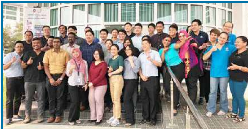
Cadaveric Dissection Workshop