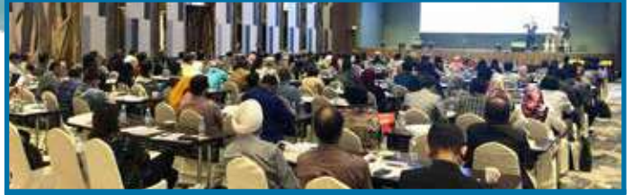
MSO-HNS Johor Bahru ENT Primary Care Symposium at Trove Hotel, Johor Bahru

MSO-HNS organised the ENT Primary Care symposium at Trove Hotel, Johor Bahru, Johor on 19 October 2019. There were 128 participants at the workshop. The panel speakers were mainly from Johor with others from Perak, Penang, Sabah and Sarawak. This successful event was supported by seven medical companies which enabled the participants to be updated with their products.