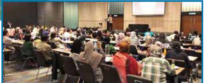
MSO-HNS Kuala Lumpur ENT Primary Care Symposium at Aloft Hotel, Kuala Lumpur

MSO-HNS organised the ENT Primary Care Symposium at Aloft Hotel, Kuala Lumpur. Despite being a rainy Sunday morning, there were about 120 participants. The panel speakers were mainly from the Klang Valley. This successful event was supported by eight medical companies.