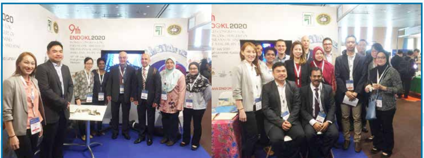
Part of the Organising Committee who joined EndoBarcelona during the handover ceremony and booth display in 2018

However, in view of fact that the event will receive many international participants, the Organising Committee has decided that it would be best to postpone it to 2022. ENDOKL2022 - 9 th World Congress for Endoscopic Surgery of the Paranasal Sinuses Skull Base, Brain and Spine is now slated for 6 to 8 October 2022. Please follow the ENDOKL website, officially ENDOKL2021.org