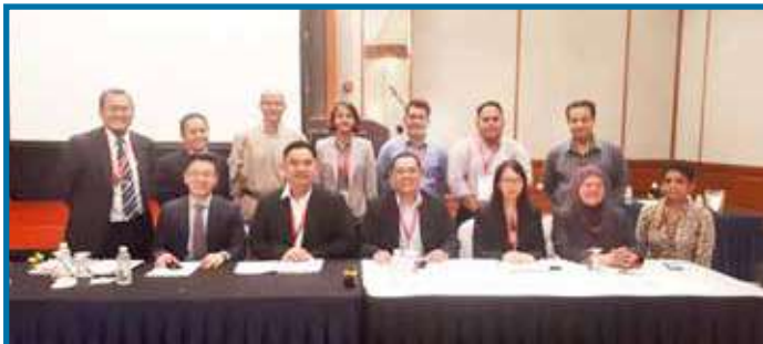
Newly elected MSO-HNS Executive Committee members 2019/2020 at 39 th Annual General Meeting 2019