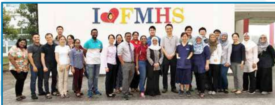
Paediatric Airway Workshop