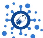
Malaysian Society of Infection Control & Infectious Diseases (MyiCID)