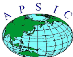
ASIA PACIFIC SOCIETY OF INFECTION CONTROL