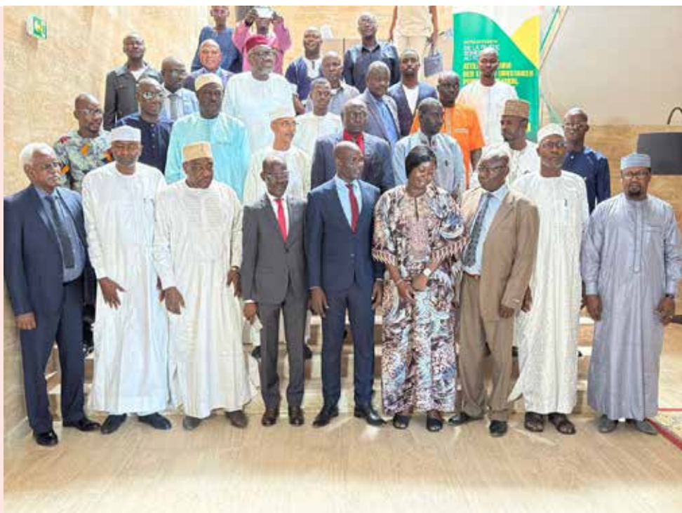
Participants pose for a group photo at The National Workshop on Policy Guidelines for the Creation, Protection and Commercialization of New Plant Varieties in Chad.

The workshop resulted in the development and adoption of the “Preliminary Draft Policy for the Creation, Protection and Enhancement of New Plant Varieties for the Development of the Seed Sector in Chad”, which is