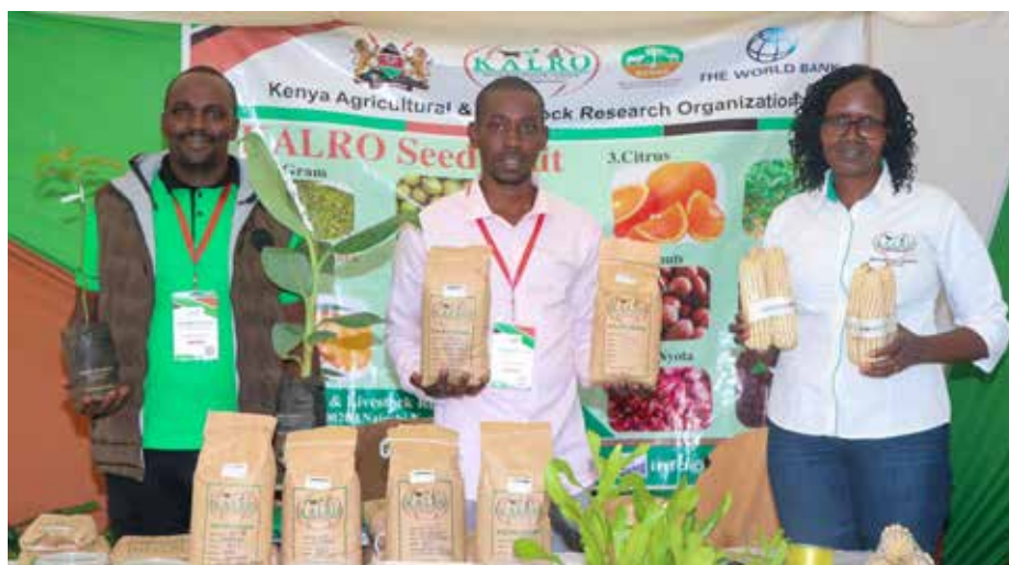
Exhibitors from Kenya Agricultural Research Organisation captured at a recent seed show.

During his presentation, he explained three main types of seeds that Kenyan farmers use: Landrace