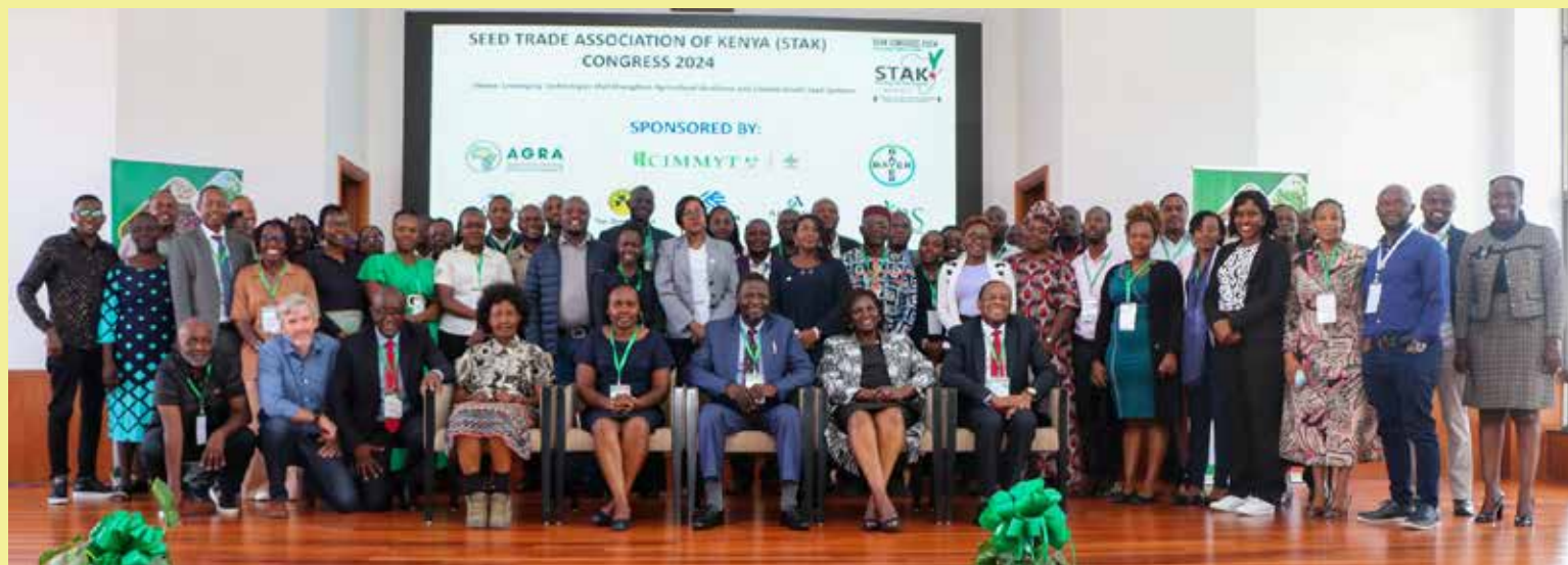
Participants pose for a group photo at the 12th annual congress of the Seed Trade Association of Kenya (STAK).