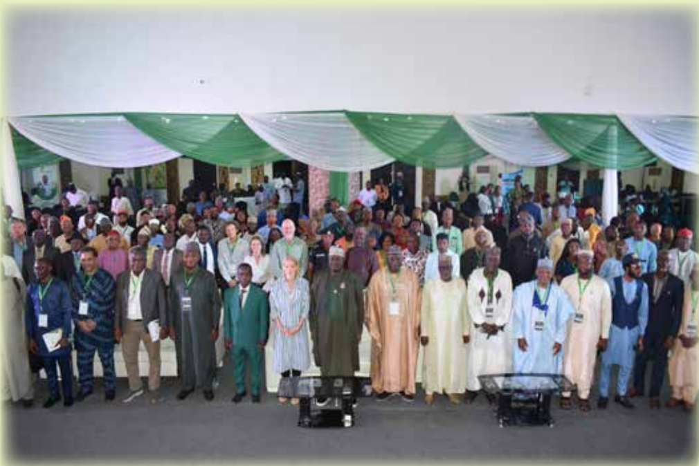
Participants at the 7 th edition of the Seed Connect Africa 2024 Conference in Abuja, Nigeria, held on 26 th and 27 th November, 2024 in Abuja, Nigeria.

The African Seed Trade Association recently explored the benefits of seed companies attending the annual congress held by AFSTA. Now in its 25 th anniversary, the next congress will be held in Kigali, Rwanda from March 3 to 5, 2025.