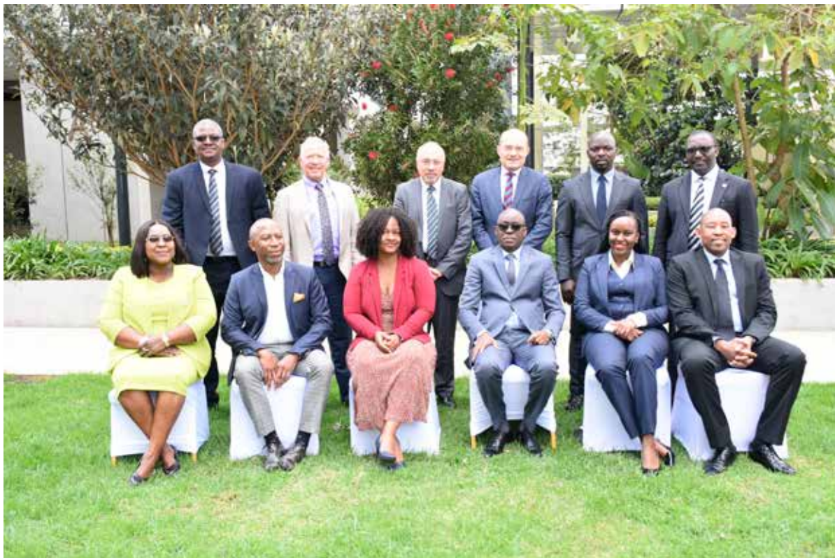
AFSTA Board Members pose for a photograph during the October meeting in Nairobi, Kenya

By AFSTA Correspondent I afsta@afsta.org