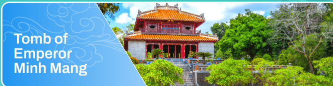
Tomb of Emperor Minh Mang