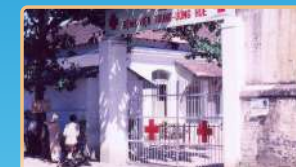
Hue Central Hospital in the Past, Before Renovation and Expansion