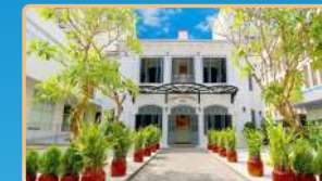
The Tradition House of Hue Central Hospital

including professors, PhDs, and top specialists