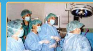
The first laparoscopic donor nephrectomy in Vietnam (2002)