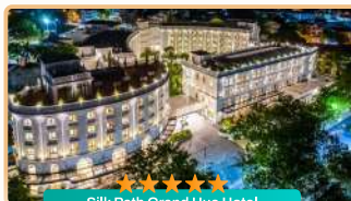
Silk Path Grand Hue Hotel

Hue features a wide selection of luxurious 4- and 5-star hotels that harmoniously blend traditional charm with modern comfort. Many are located along the Perfume River and in the city center, showcasing the imperial heritage and refined hospitality that define Hue.