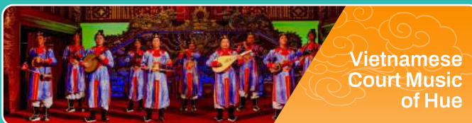
Vietnamese Court Music of Hue