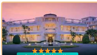
Azerai La Residence Hue