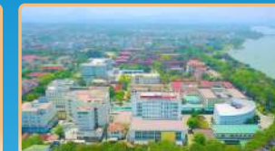
The Panorama of Hue Central Hospital Today