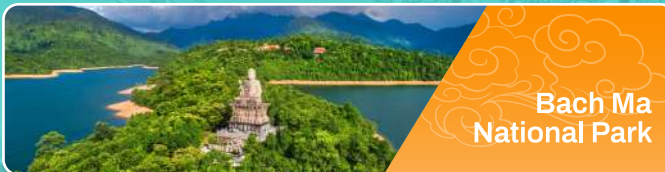
Bach Ma National Park