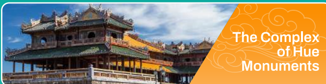
The Complex of Hue Monuments

Hue is renowned for its system of historical sites, royal tombs, pagodas, and temples that bear the distinctive imprint of the Nguyen Dynasty, including the Imperial City, Thien Mu Pagoda, and the Tombs of Tu Duc and Minh Mang. Each structure harmoniously blends nature, architecture, and the essence of traditional culture.