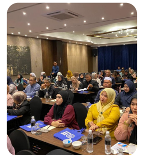
YOUTHPRENEURS PITCHING PLATFORM