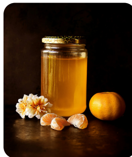
CONSUMER FAIR FOR HALAL PRODUCTS

The event serves as a networking platform for the halal industry, featuring halal-certified products and services across various sectors like food, cosmetics, and textiles. It includes conferences and workshops on halal branding, market trends, certifications, and industry challenges, enhancing participants' knowledge and experience.