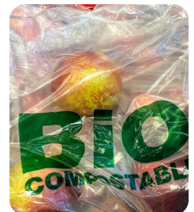
ESG, SUSTAINABILITY & HALAL TECHNOLOGY SHOWCASES