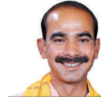
SHRI AJAY TAMTA Minister of State for textiles