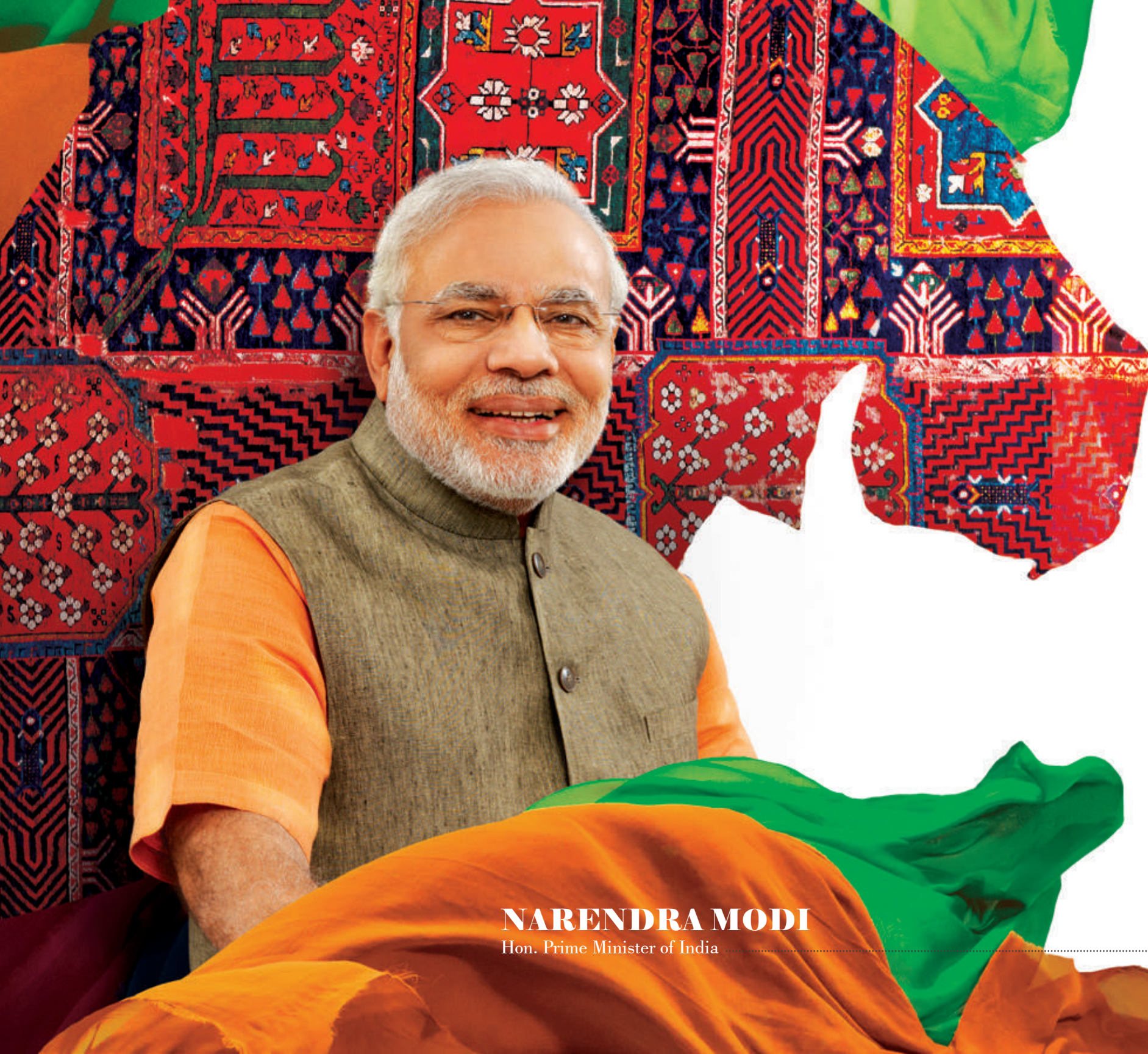
NARENDRA MODI Hon. Prime Minister of India