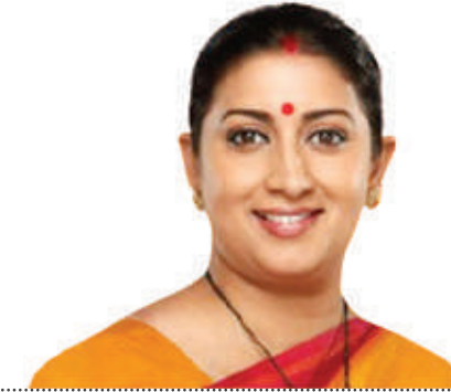
SMT. SMRITI ZUBIN IRANI Minister of Textiles