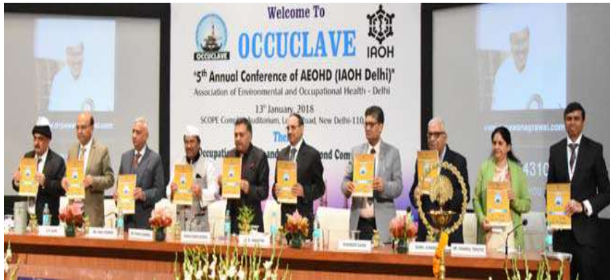
Release of OCCUCLAVE Souvenir