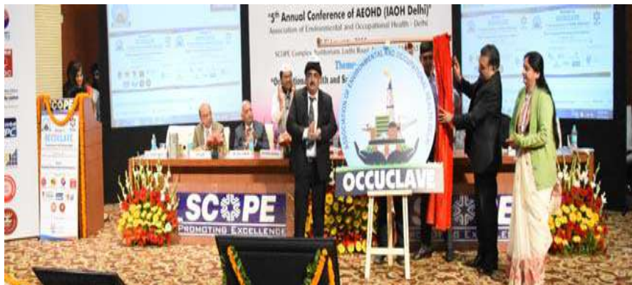
Release of OCCUCLAVE Logo