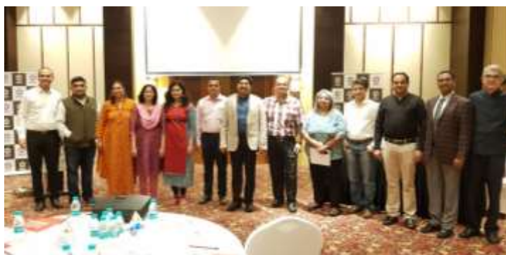
Group Photo of Organizing Committee at the end of the Special Convention 2017 of IAOH Mumbai Branch