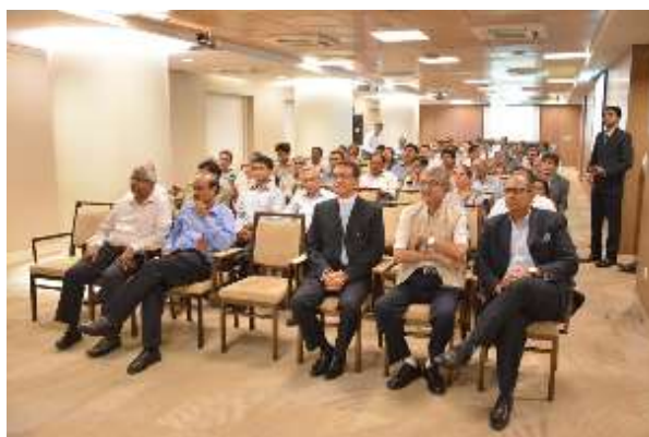
Delegates attending CME held in conjunction with H N Hospital on 27th February 2016