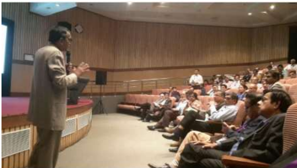
66th National Conference of IAOH: Conference in Progress