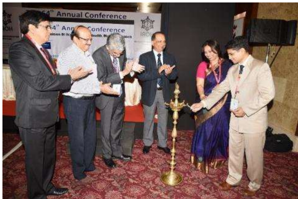
64 th Annual Conference IAOH Mumbai Branch: Inaugural Ceremony- Lighting the Lamp