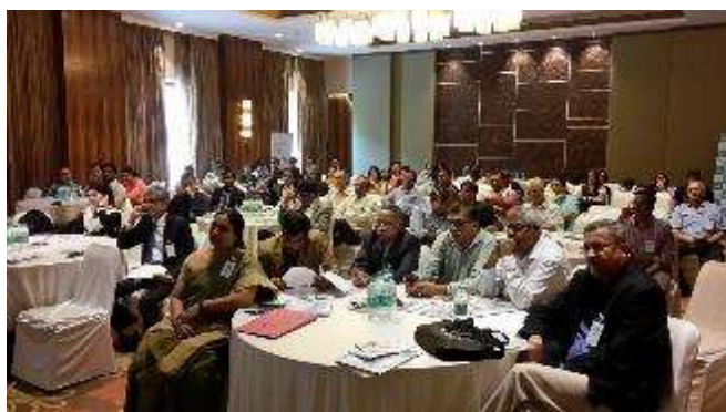
Delegates in rapt attention at the Outbound Convention held at Fariyas Resorts, Lonavala on 28 th & 29 th Nov 2015