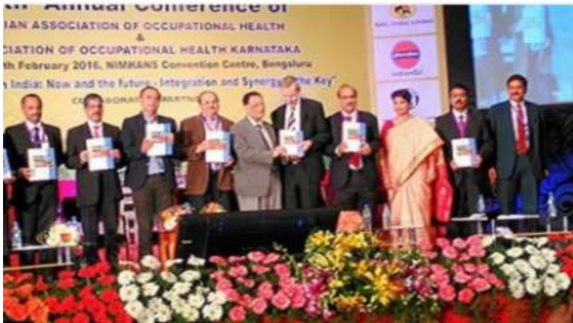
66 th National Conference of IAOH: Release of book – 'BOHS for Informal Industry - manual for Primary Care Providers'