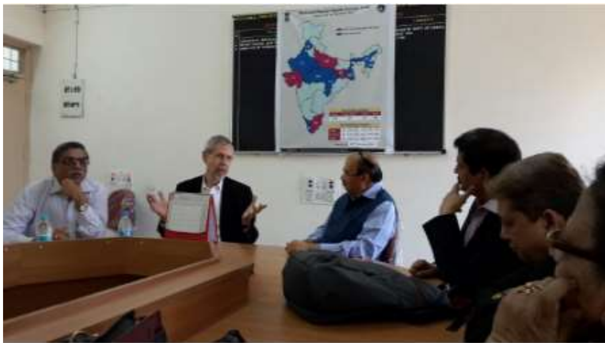
66th National Conference of IAOH: A business meeting of IAOH CCM with ICOH President