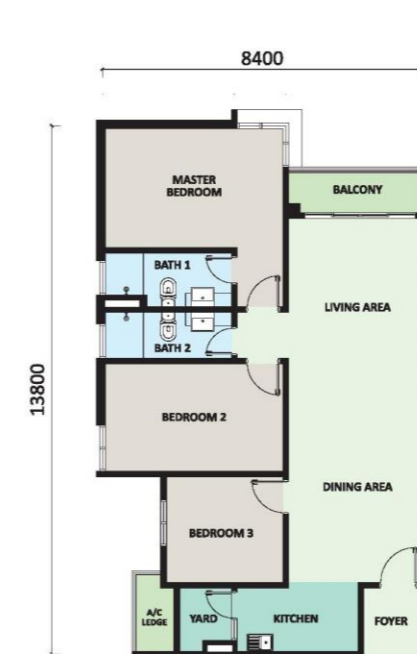
type A 3 Bedrooms 2 Bathrooms 1,116 sqft