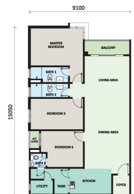
type D 3 + 1 Bedrooms 3 Bathrooms 1,400 sqft