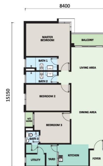
type C 3 + 1 Bedrooms 3 Bathrooms 1,304 sqft