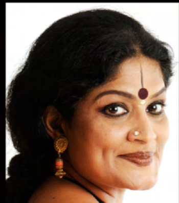
GEETA CHANDRAN DANSUESSE(Padmashree) MC Member, Shruti Foundation