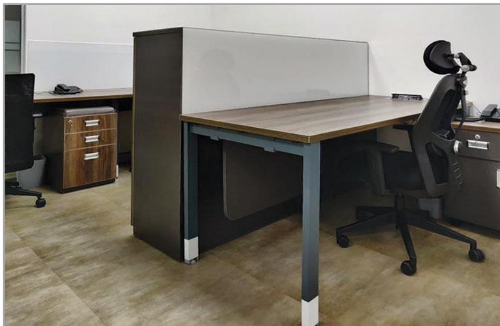
One Senior Executive