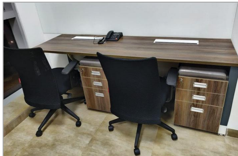
+ Two Executives

Payment Options: Quarterly, Half yearly, Annually