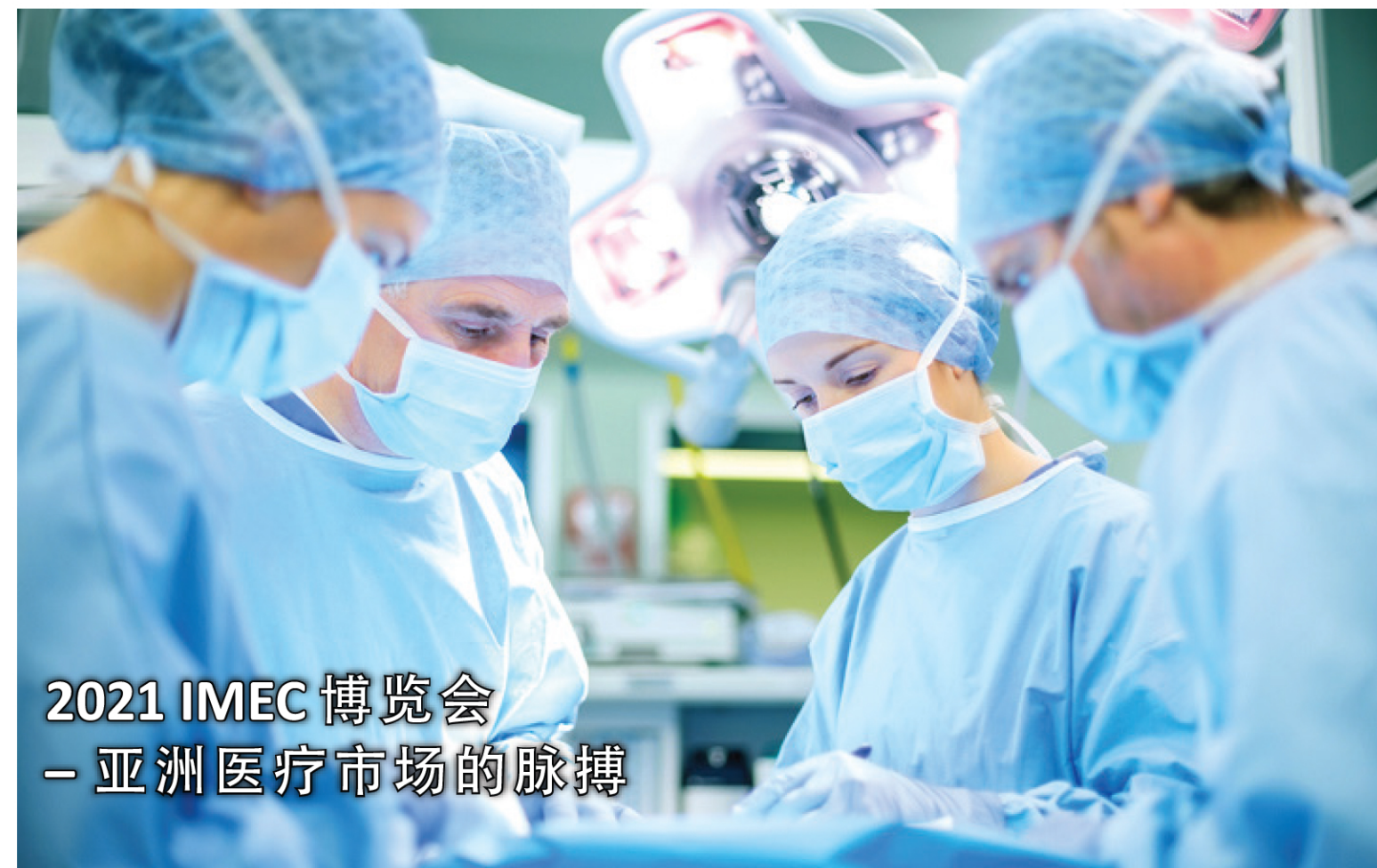
2021 IMEC 博览会 – 亚洲医疗市场的脉搏