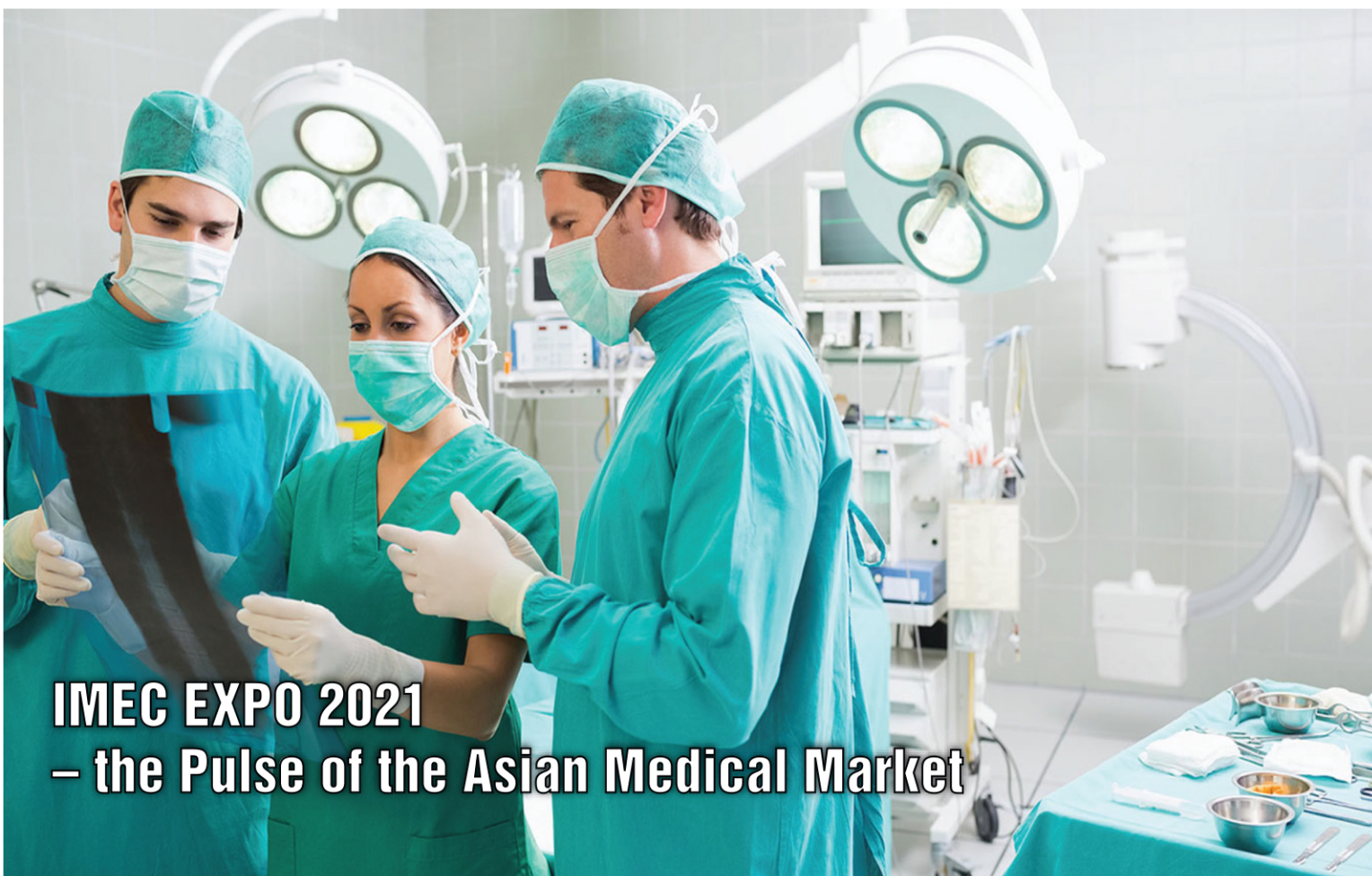
IMEC EXPO 2021 – the Pulse of the Asian Medical Market