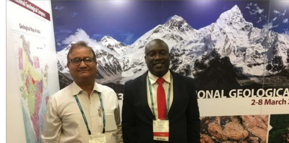
The 36 th IGC delegation with other geoscientists at the 13 th IAEG event