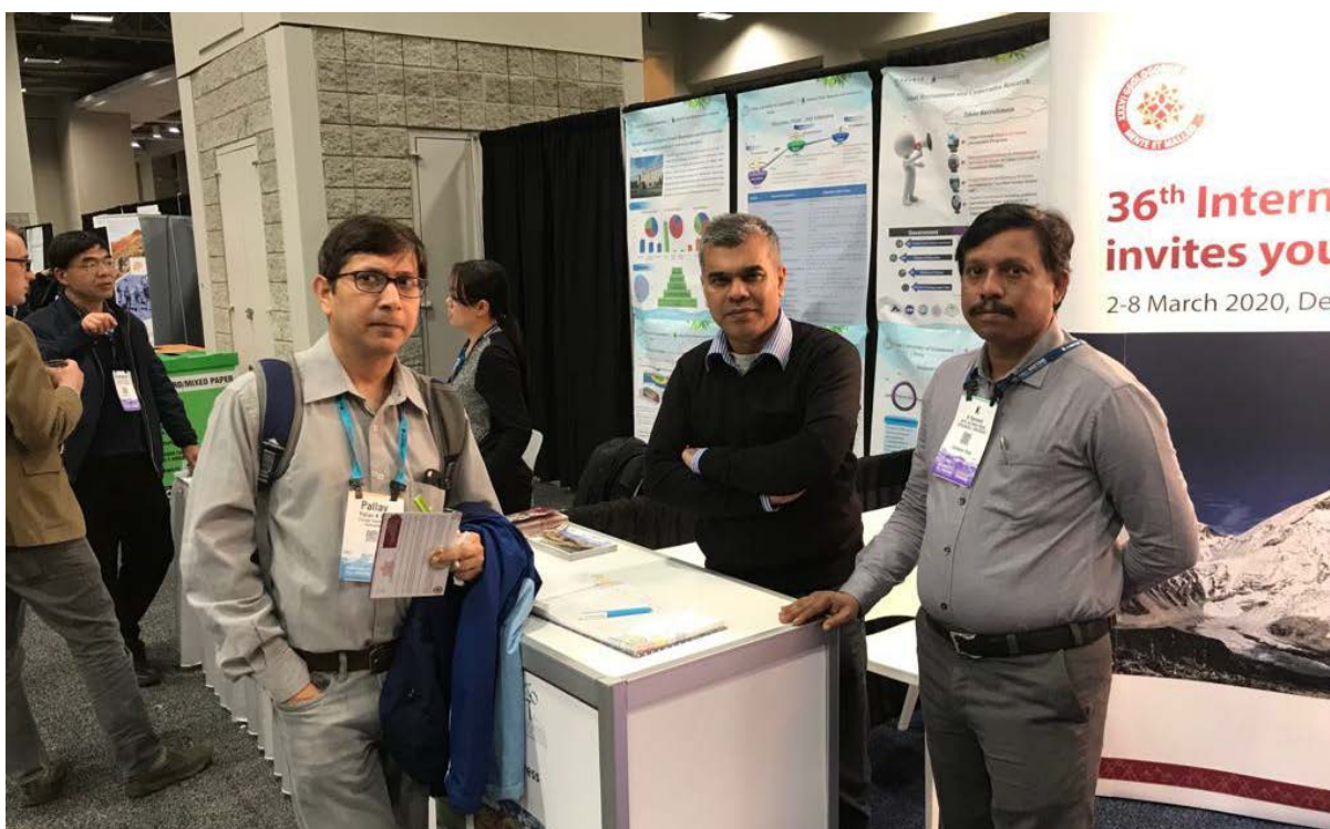
The 36 th IGC delegation at the AGU event