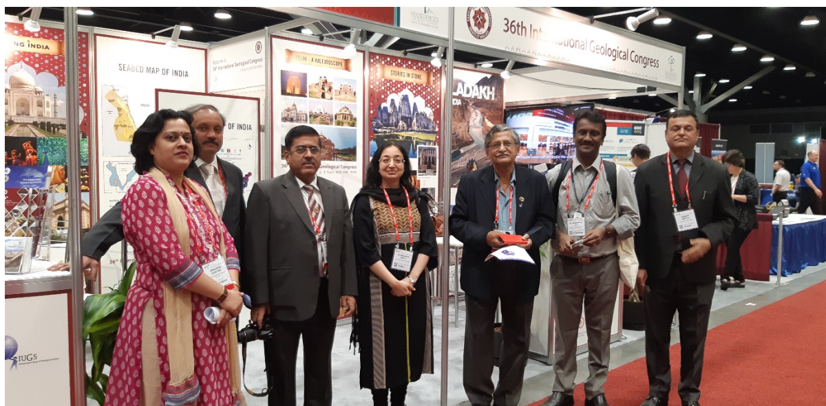
The 36 th IGC delegation with visitors of the 36 th IGC booth at the RFG event

Congress. The delegation also utilized the opportunity for exploring the avenues for creating funding and other support from the global stakeholders. Discussions were held with the Geological Society of America (GSA) for creating funding schemes for participants of 36 th IGC. The Commission for the Management and Application of Geoscience Information (CGI) distributed leaflets for a competition for participation in 36 th IGC. The status of the preparatory activities for 36 th IGC was discussed in a meeting between the 36 th IGC delegation and the IUGS Executive Committee.