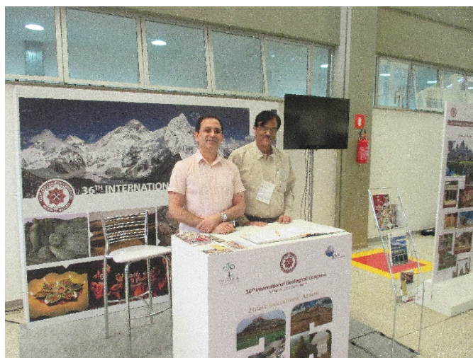
The 36 th IGC delegation at the 8 th GeoSciEd event