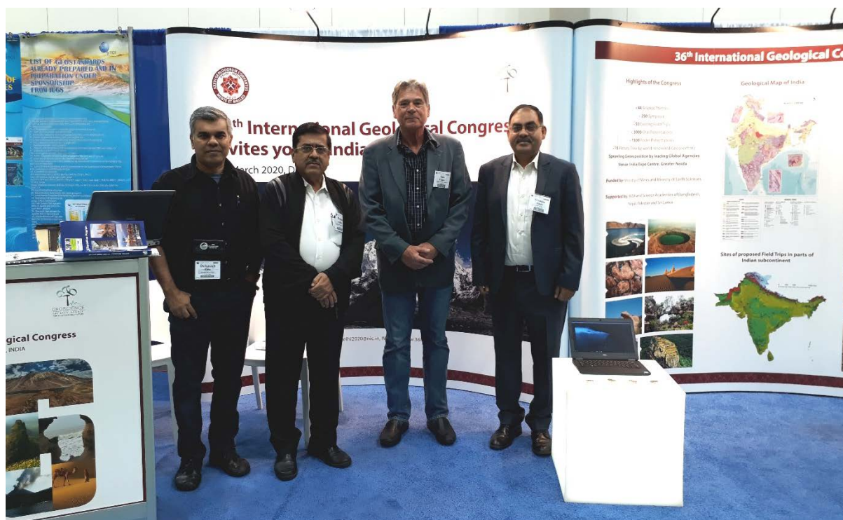
The 36 th IGC delegation with Secretary General, IUGS at the GSA event