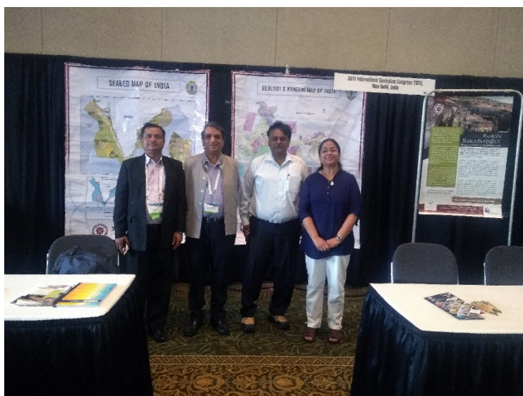
The 36 th IGC delegation at the 15 th AOGS event